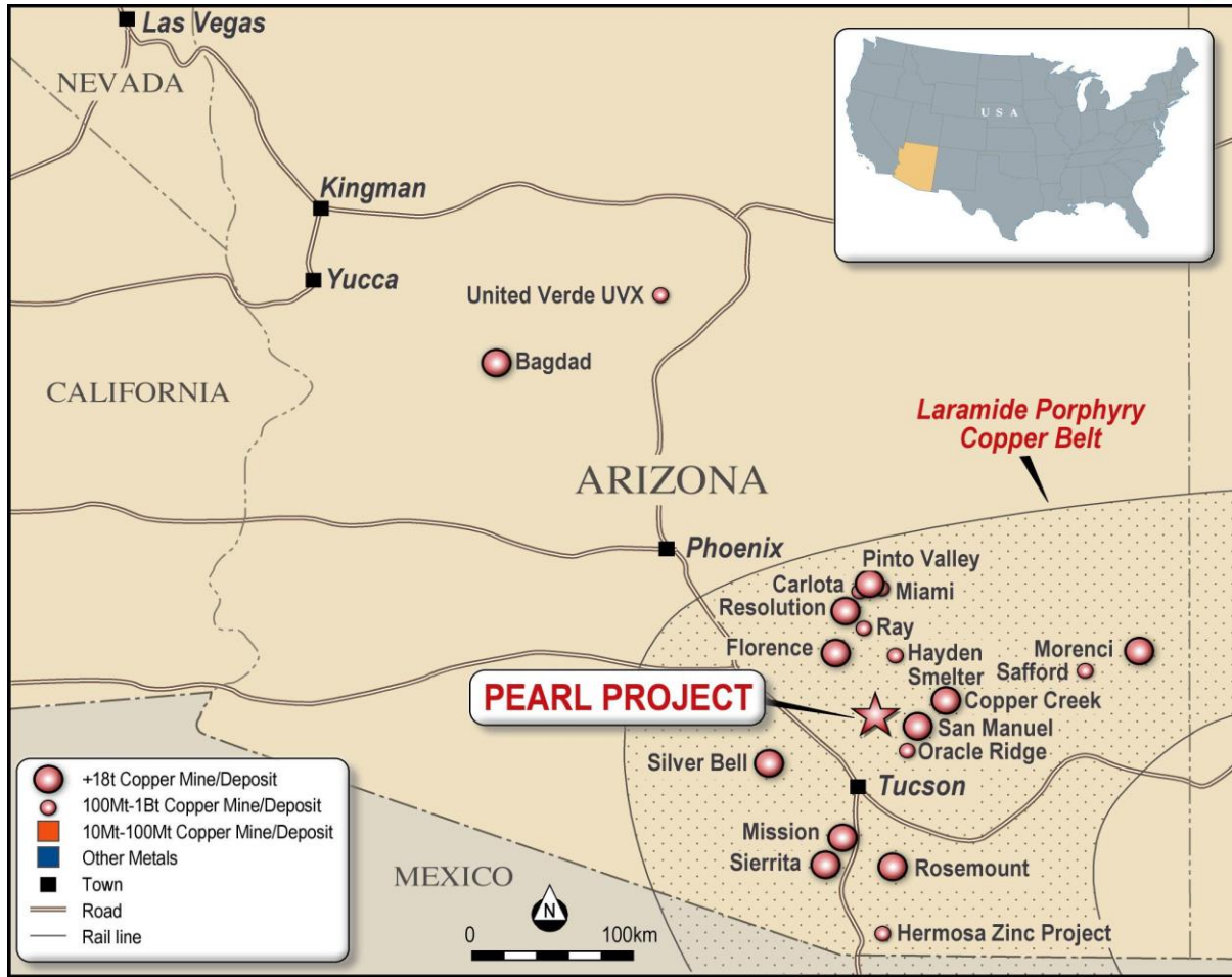
Figure 5: Major resource projects in Arizona, USA.