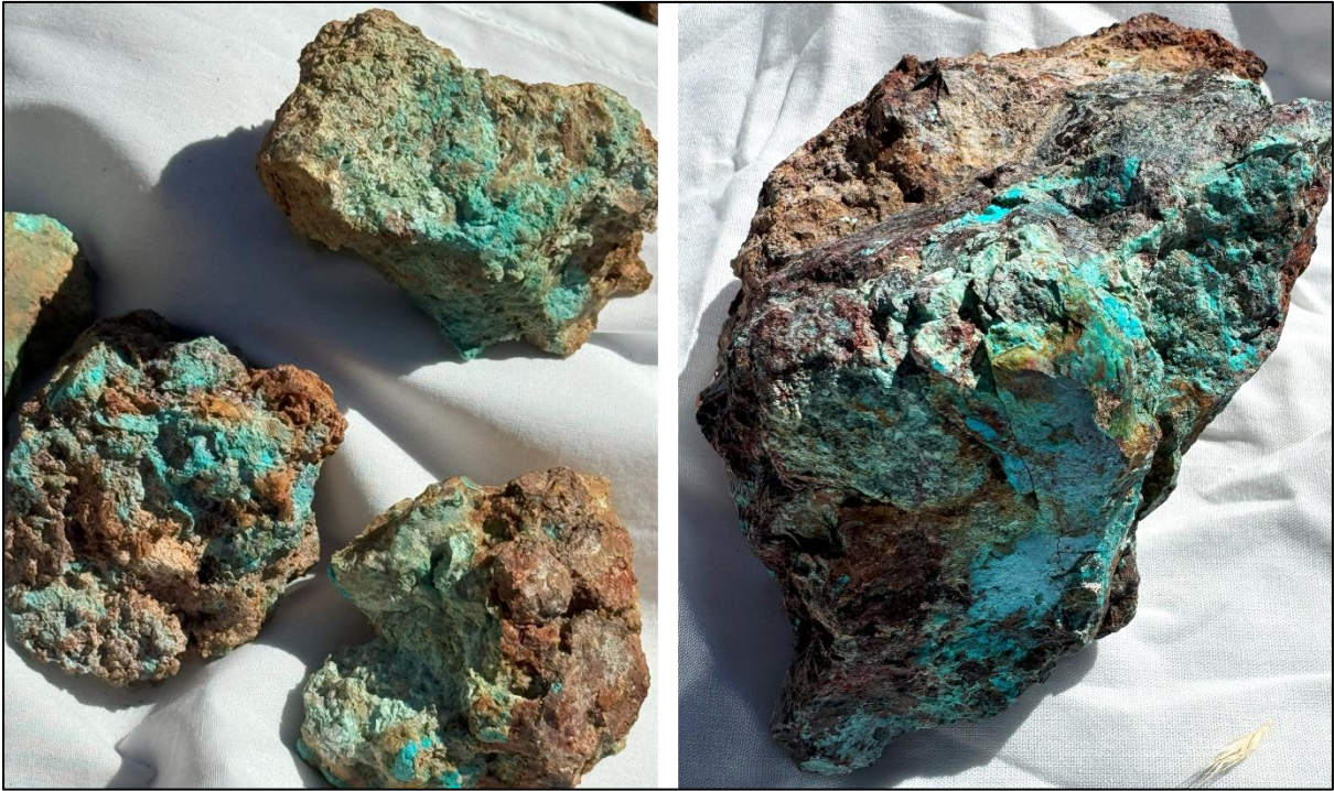
Figure 1: Odyssey rock chip samples. Sample 24PRL0123 (Left), 312 g/t Ag, 7.34% Cu, 4.34% Zn. Sample 24PRL0117 (Right), 76.1 g/t Ag, 3.48 % Cu, 24.8% Zn