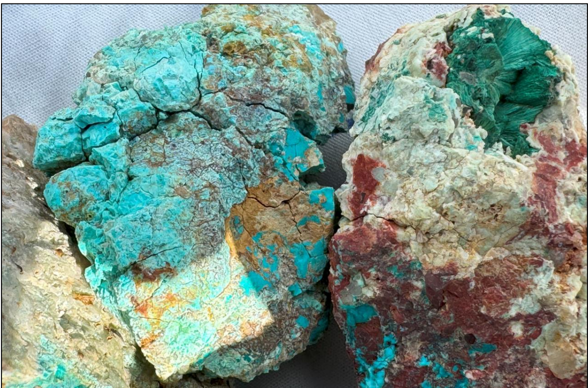
Figure 2: Sample 24PRL0106, 240 g/t Ag, 7.74% Cu, 2.03% Pb, 1.14% Zn