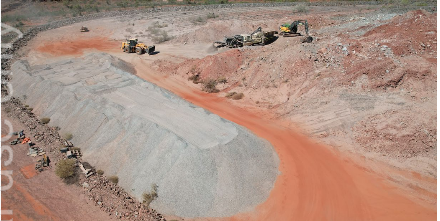
Figure 2: Commercial scale waste rock to road base product trial 1