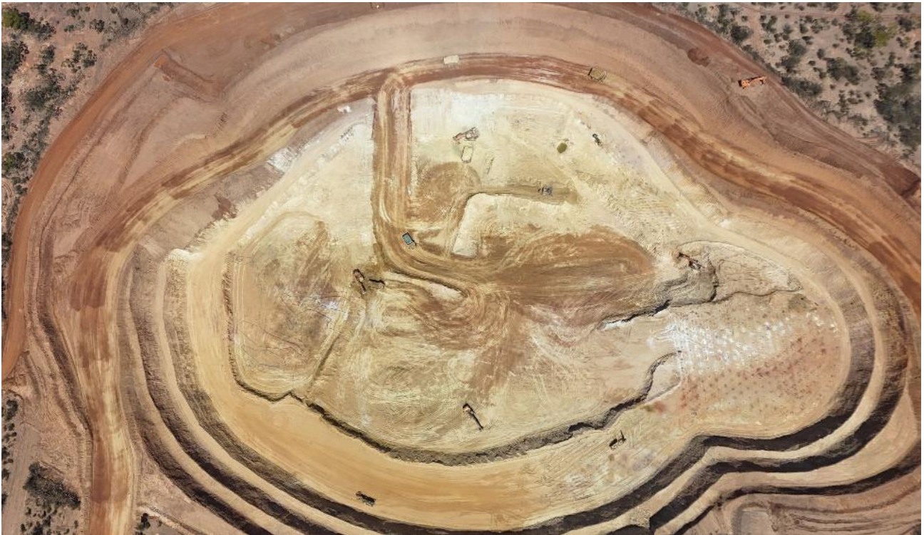
Figure 2: Myhree open pit (looking west) with multiple dig fleets and drill and blast activities

Myhree has produced ~150kt of Ore to 30 November 2024 with grade reconciliation to the block model as expected at this stage of the pit. Three dig fleets are operating with grade control drilling now underway from the 365mRL.