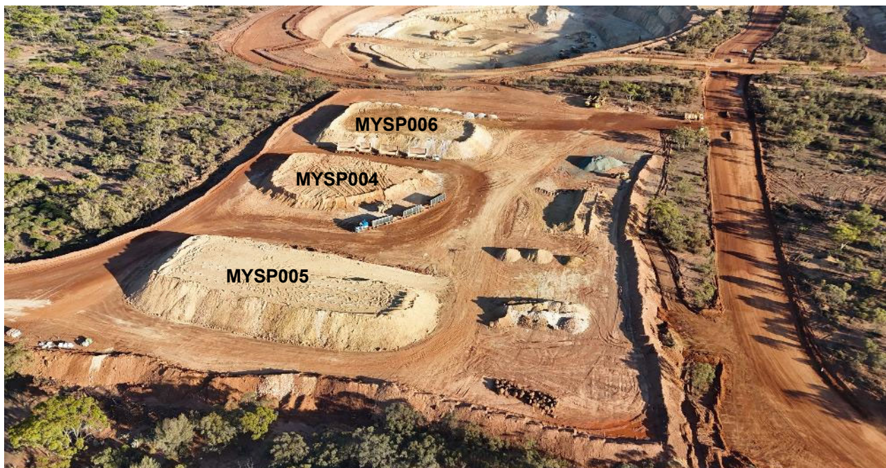
Figure 1: Myhree ROM pad (looking north) showing current stockpiles being hauled or under construction

Black Cat’s Managing Director, Gareth Solly, said: “Excellent progress is being made at Myhree/Boundary with accelerated mining delivering ~150kt of Ore, well ahead of schedule. Expedited cashflow from Myhree/Boundary complements the commencement of gold production at Paulsens this month and underpins Black Cat producing more gold, sooner from multiple operations.”