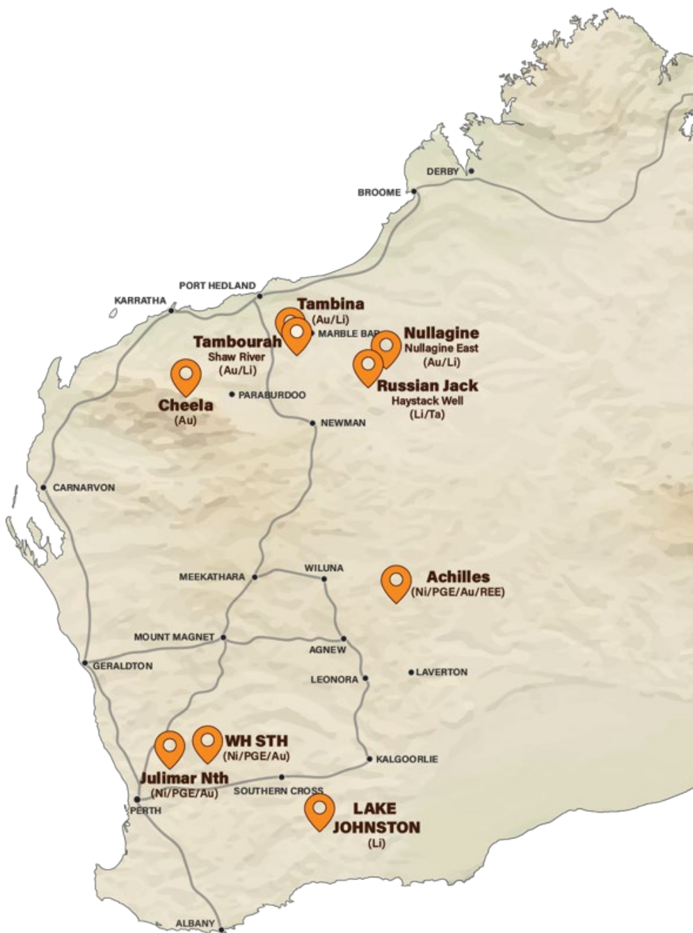
Figure 3 Tambourah Metals Project Locations