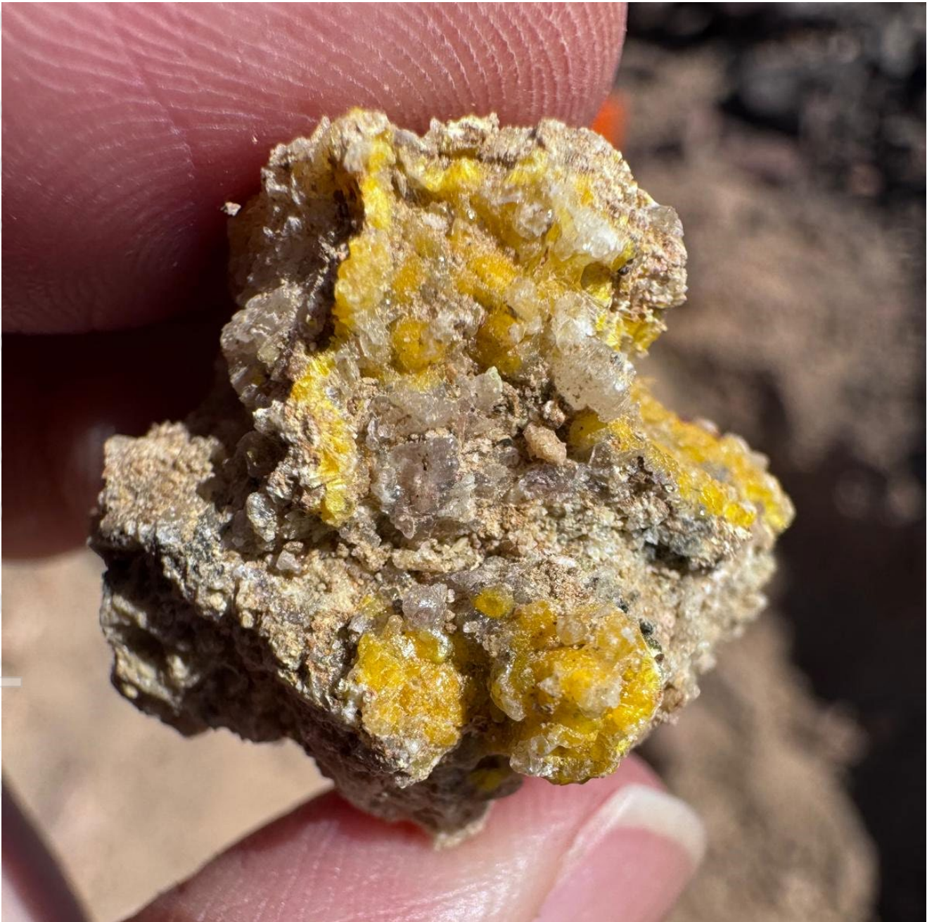
Figure 3. A field specimen of uranophane (a secondary uranium mineral) gathered from the site of sample CMRS4 at the Etango North-East Project