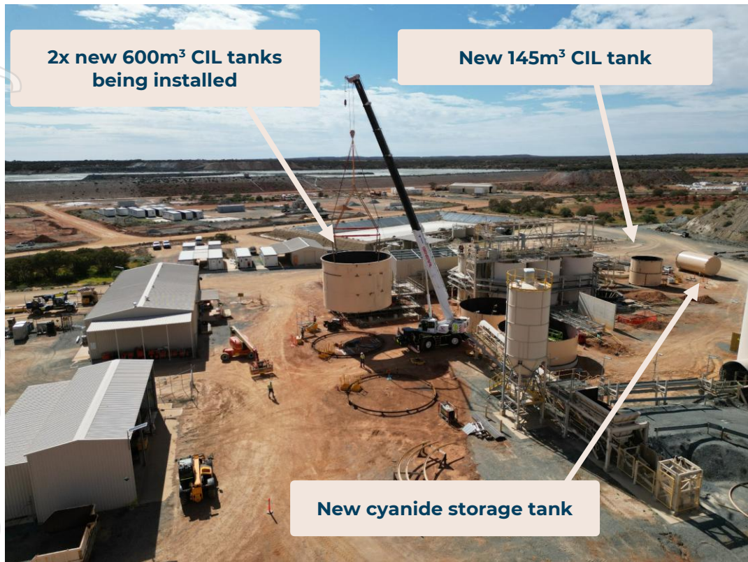
Figure 1: Drone image of the 2x new 600m 3 tanks being installed for the expanded CIL circuit, December 2024.

Meeka Metals Limited (“Meeka” or the “Company”) is pleased to provide a pictorial update of the continued progress made during December 2024.