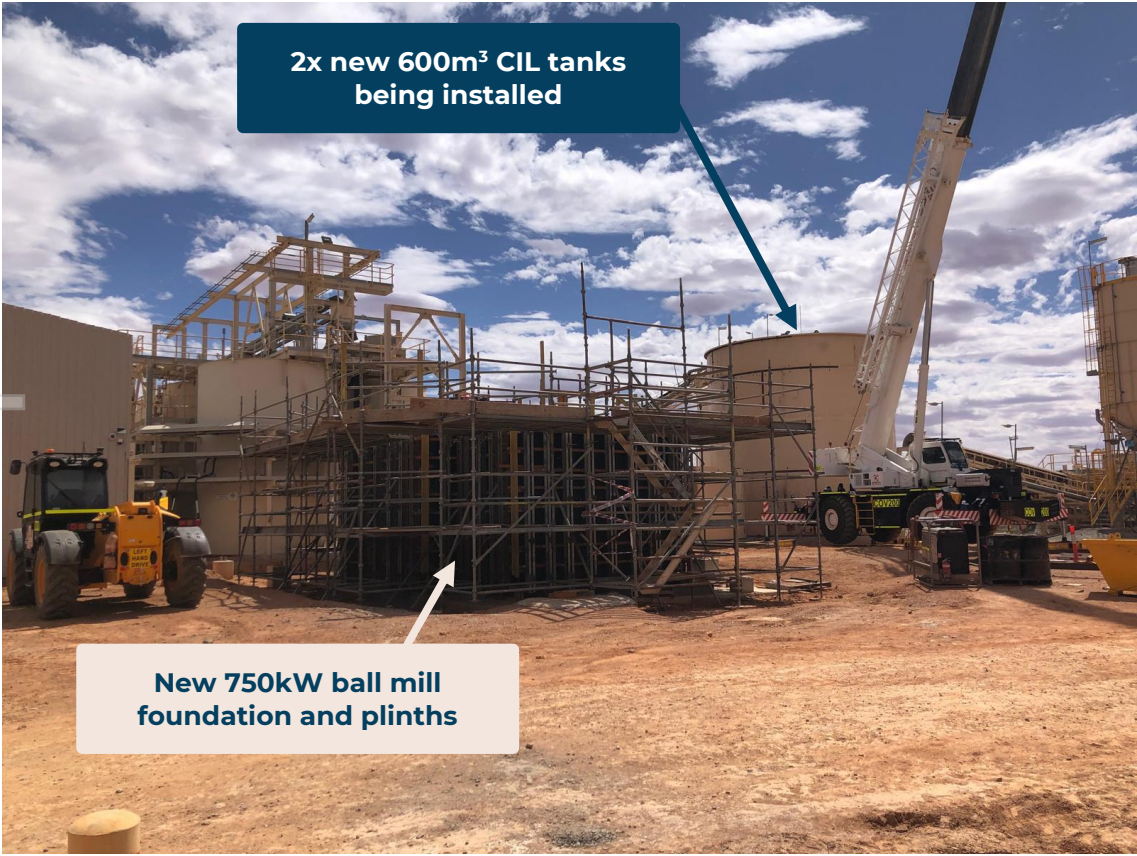
Figure 4: New ball mill foundation and plinths for larger 750kW ball mill, December 2024.