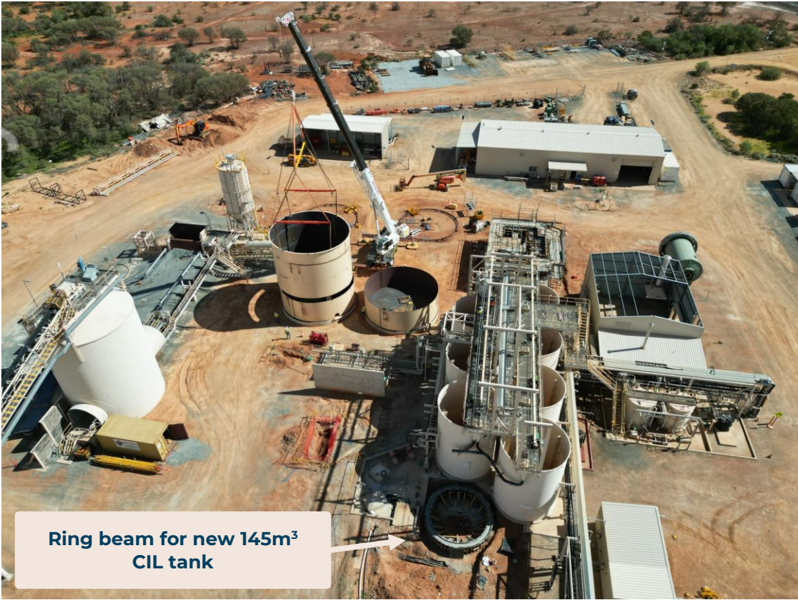
Figure 3: Drone image of tank installation, December 2024.