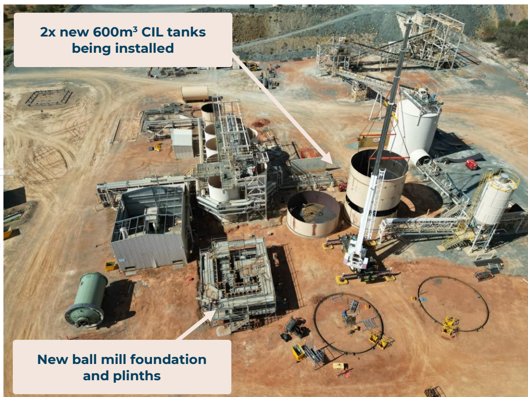
Figure 2: Drone image of the new ball mill foundation and plinths in the foreground and tank installation in the background, December 2024.