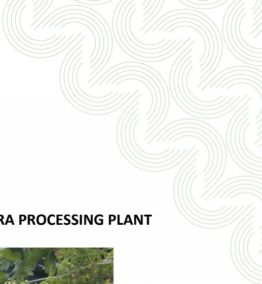
PHOTO 4: NEW AGITATOR TANKS BEING INSTALLED – SANTA BARBARA PROCESSING PLANT