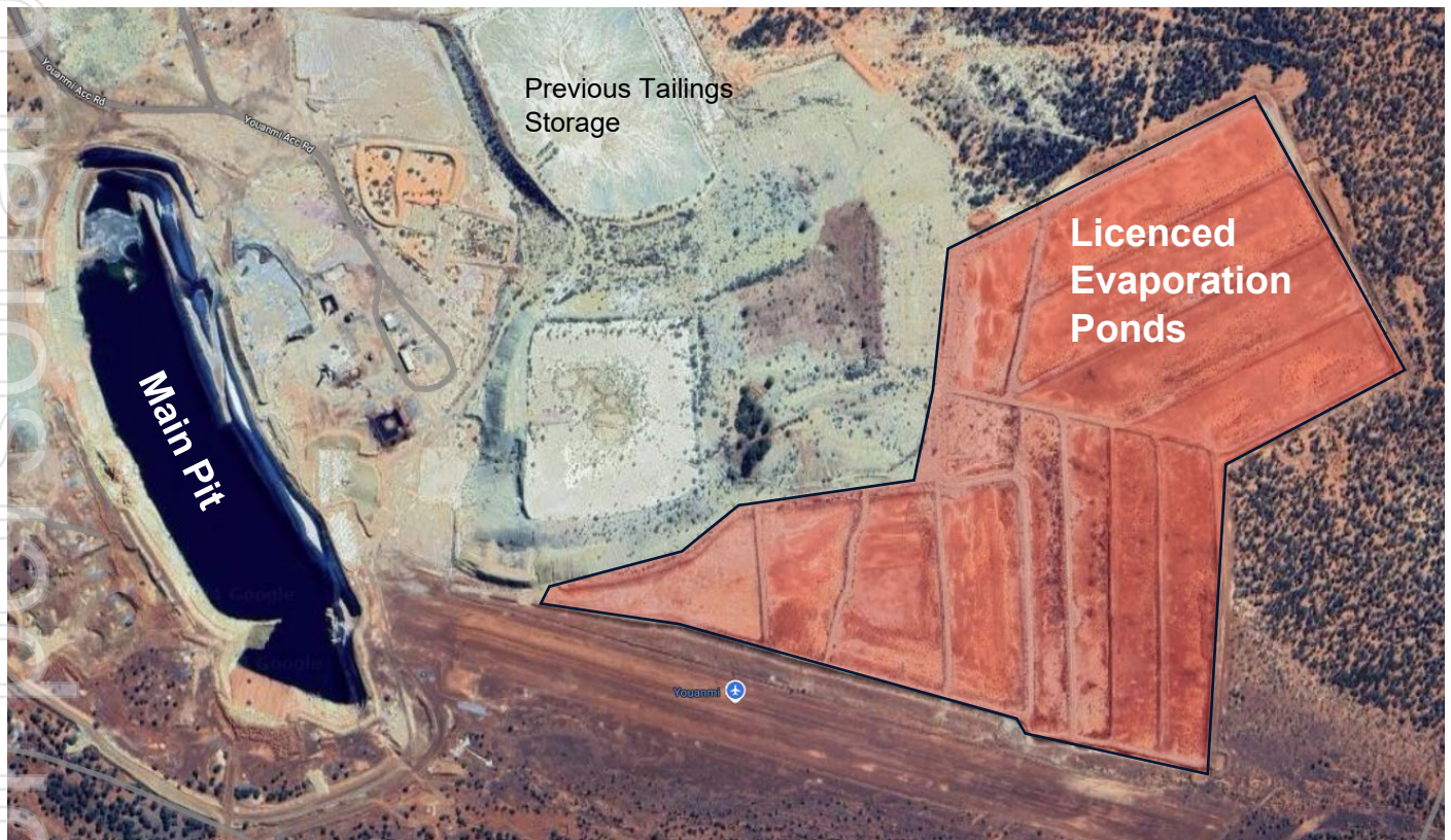
Figure 2: Plan view showing the location of dewatering infrastructure.

Works are well advanced on early dewatering with tenders received for the minor refurbishment works on the fully permitted evaporation ponds, along with quotes on the pumping infrastructure requirements. Environmental works have commenced to seek permitting for dewatering to the northern pits, accelerating the opportunity to access the lower areas of the main pit and the previous underground workings.