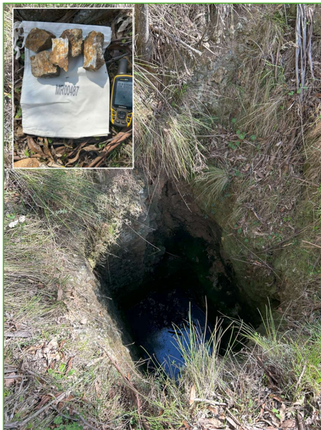
Figure 2 – Lagoon Ck Prospect historic working and location of samples MR00487-MR00489