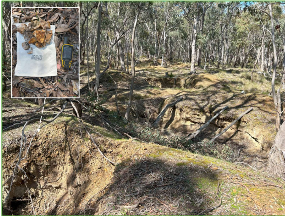
Figure 1 – Napolean East Prospect historic workings and location of sample MR00479

Assay results from the remaining 24 samples collected did not return significant mineralisation. These samples were part of a broader reconnaissance effort aimed at testing the extent and variability of the geological features across the area.