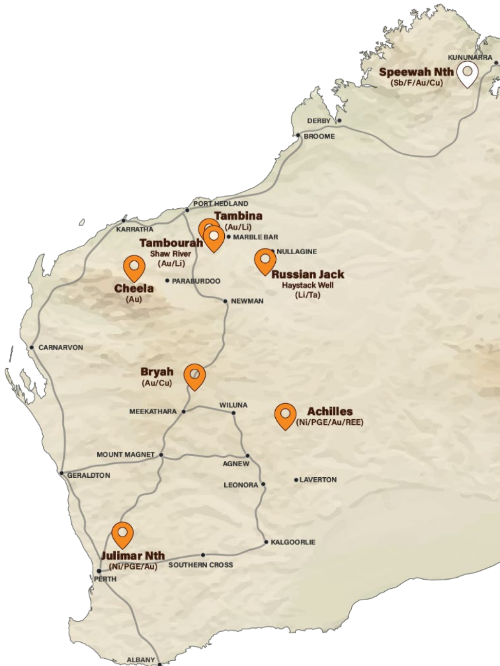
Figure 3: Tambourah Metals Project Locations