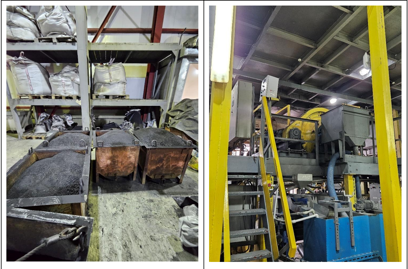
Figure 1 - Sarytogan Graphite after first stage crushing to 5mm size (LHS) and mill in Karaganda laboratory for next stage (RHS).