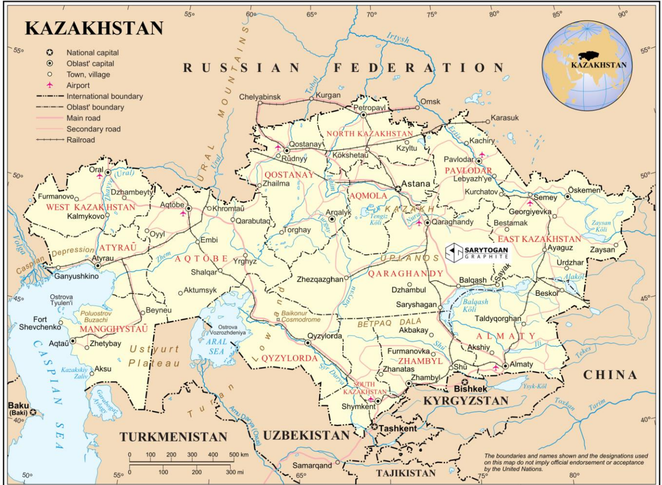
Figure 2 - Sarytogan Graphite Deposit location.

The Sarytogan Graphite Deposit is in the Karaganda region of Central Kazakhstan. It is 190km by highway from the industrial city of Karaganda, the 4th largest city in Kazakhstan (Figure 2).