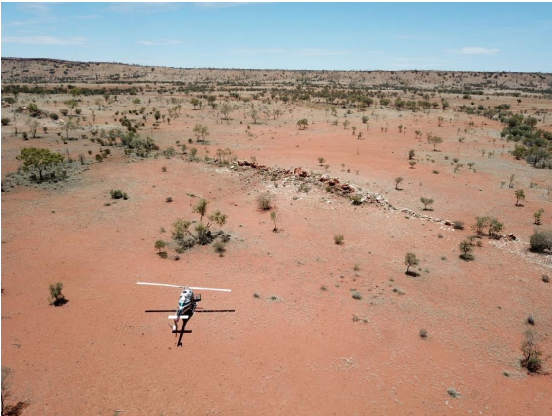
Figure 2: Outcropping Fluorite at Reef E while conducting rock chip sampling, December 2024

The processing solution to recover an acid grade fluorspar product based on information from these rock chip samples is therefore anticipated to be similar to the process flowsheet for the Speewah Fluorite Project. To assess the viability of producing an acid grade fluorspar or metallurgical grade fluorspar from the deposit, metallurgical testwork is required. Tivan will investigate process options and metallurgical testwork programs on samples obtained from future exploration programs.