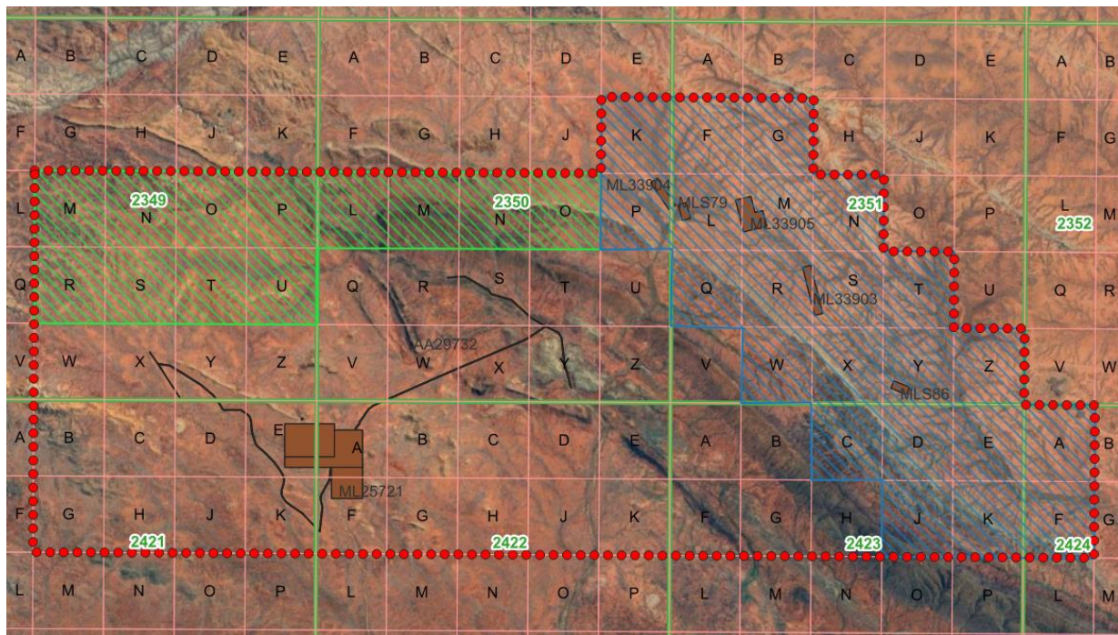
Figure 3: Map showing proposed subdivision of EL22349. The blue shaded area is to be subdivided and transferred to Tivan as part of the acquisition; Tivan has rights to explore for fluorite in the green shaded area.

Following the completion of resource mapping, Tivan will apply for an Environmental (Mining) Licence in conjunction with progressing all other relevant regulatory processes.