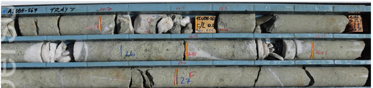
Figure 1: Drillhole A1UDH-567 showing the first mineralised intercept

Visible gold was noted in the brecciated quartz and moderately altered dyke from 24.7-24.9m. Unfortunately, 0.4m of core was lost during this drilling (Figure 1). The lost core may be underreporting the width and grade of this intercept.