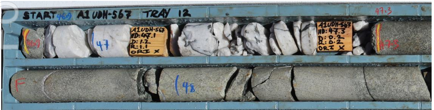
Figure 2: Drillhole A1UDH-567 showing the second mineralised intercept

The second mineralised vein included several greasy, erratic sulphidic-stylolitic veinlets and was encountered from 46.9-47.3m (Figure 2).