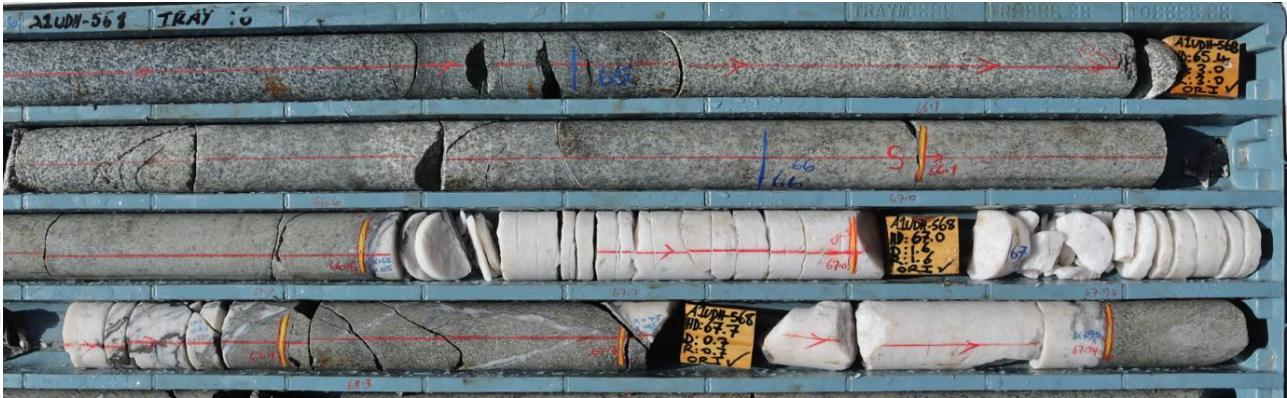
Figure 3: Drillhole A1UDH-568 showing a quartz intercept

Hole A1UDH-568 was targeting the Bass Reef and parallel structures and/or potential orthogonal structures within the diorite dyke. One significant quartz structure was identified (Figure 3). Both contacts are significantly stylolitic but no visible gold was noted.