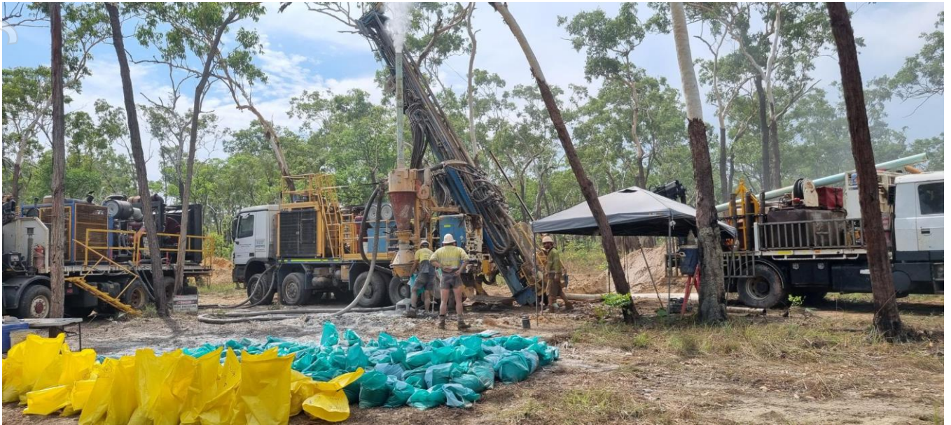
Figure 2: Drill rig with associated support trucks at West Bloc