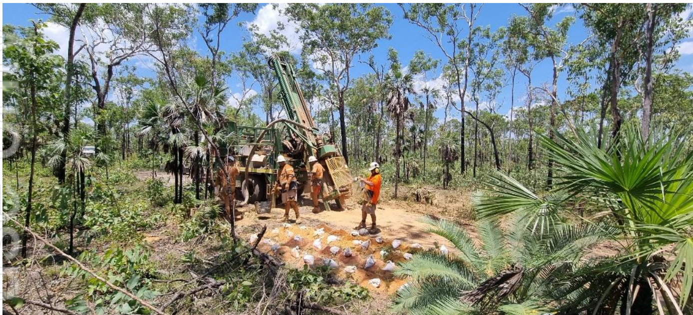
Figure 1 : Aircore drilling targeting LCT pegmatites in the west of the lease