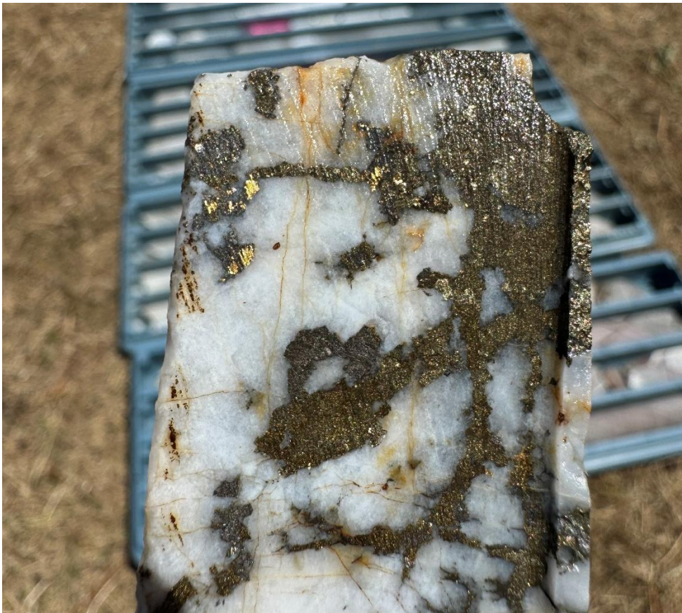
Figure 3. Close-up photo of previously drilled core from hole HVD003 (~190.4m down hole) at the Happy Valley Trend, taken during recent reconnaissance to the region. The ultra-high grade mineralisation in the photo includes abundant patches of visible gold (yellow) hosted with sulphides (brown and grey) and quartz (white) and graded 0.6 metres at 2,430g/t Au . Full details of the previous drilling can be found in the Advance Metals' ASX release dated 6 January 2025.