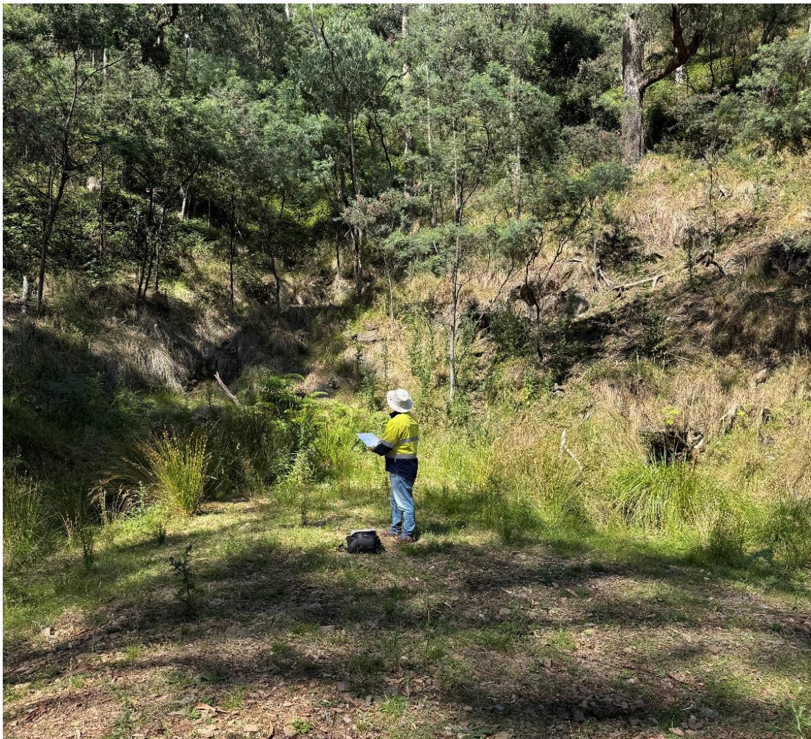
Figure 1. Advance Metals personnel inspecting a proposed drilling site on the Happy Valley Trend at the Myrtleford Project, mid-January 2025.

Following the execution of the agreement to acquire an 80% joint venture interest in the Beaufort and Myrtleford Projects with Serra Energy Metals, Advance's team have immediately commenced planning and reconnaissance activities to expedite an initial exploration program at Myrtleford. The Company has recently submitted a low impact exploration notification to Resources Victoria, with consent from the relevant stakeholders expected shortly. This will enable non-ground disturbing exploration at the project, including confirmatory/extensional drilling from existing prospect sites ( Figure 1 ).