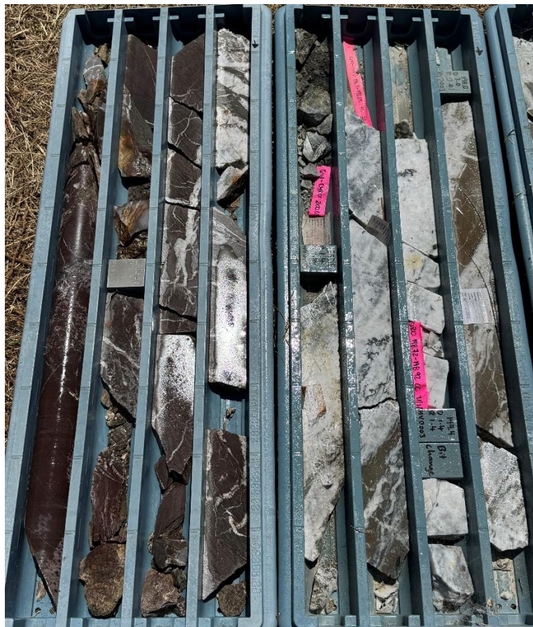
Figure 5. Photo of previously drilled core from hole HVD003 (~198-203m down hole) at the Happy Valley Trend showing quartz veining (white) that hosts the high grade mineralisation. This core forms part of an interval that graded 11.5 metres at 160.4g/t Au . Full details of the previous drilling can be found in the Advance Metals' ASX release dated 6 January 2025.