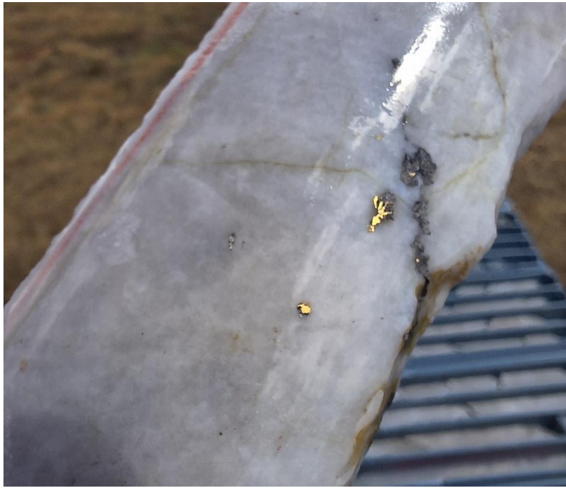
Figure 4. Close-up photo of previously drilled core from hole HVD003 (~190.5m down hole) at the Happy Valley Trend showing large patches of visible gold (yellow) hosted with minor arsenopyrite (grey) in massive white quartz. Full details of the previous drilling can be found in the Advance Metals' ASX release dated 6 January 2025.