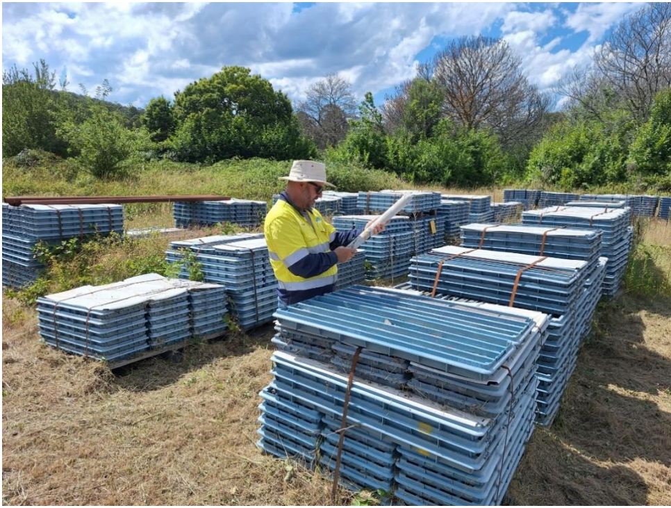
Figure 2. Advance Metals personnel inspecting core previously drilled by Serra Energy Metals at the Myrtleford Project, mid-January 2025.