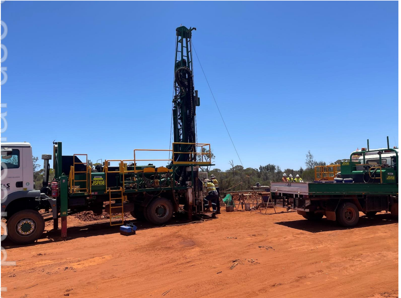
Figure 1: Diamond drill rig completing an RC twin hole for Quality Assurance and Quality Control assessment, as part of the Mineral Resource Estimate update that will be a key DFS deliverable.

Drilling has been progressing to align with the DFS completion schedule of H2, 2025. To date, 622 resource definition drill holes have been completed, totalling 37,842 meters. The majority of assay results are yet to be received with dedicated drilling updates to be provided over the coming months.