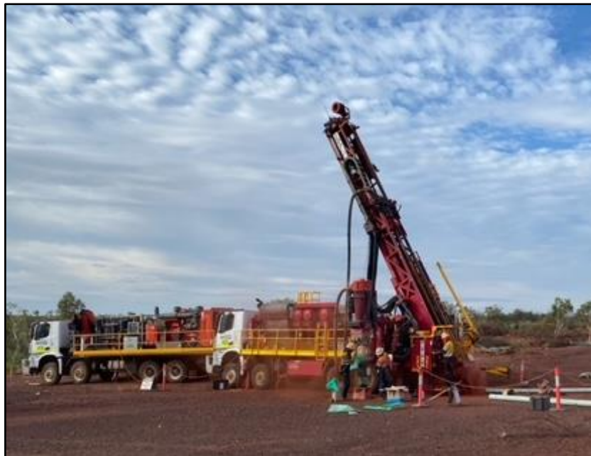
Photo 1: RC Drilling at the White Devil Gold Mine

The initial MRE will exclude the shallow eastern extension of the mineralisation. A further update to the MRE is expected once all RC drilling results have been received and incorporated, which is expected before the end of March 2025.