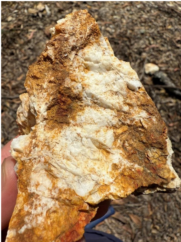
Figure 2 – Gold mineralisation within ferruginous rusty quartz vein yielding 63.10g/t Au from sample 3001227

The mineralised structures/veins, hosted in slate, are steeply dipping to the west and exhibit arkosic and chloritic alteration. There are multiple veins/structures side by side even within one set or workings. The sample location and summary of high-grade results are illustrated in Figure 1. Table 1 contains location and assay data for all 160 samples collected.