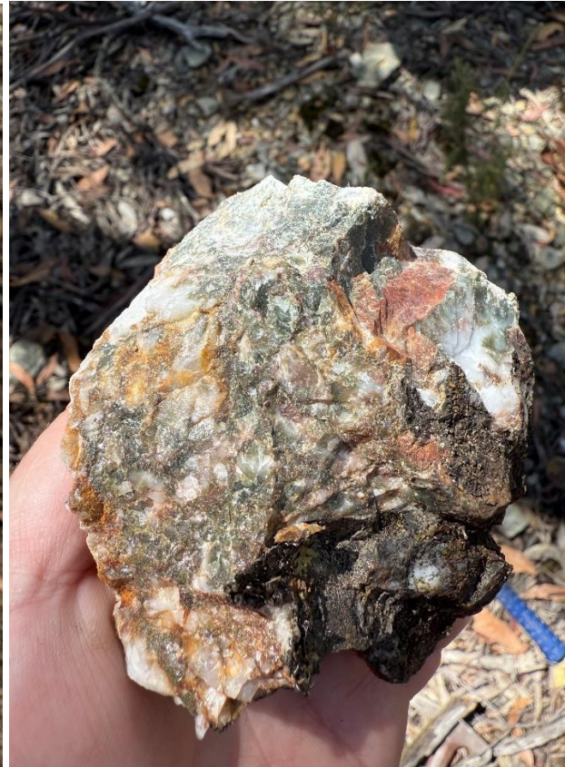
Figure 3 – Gold mineralisation within chloritic- quartz vein yielding 55.80 g/t Au from sample 3001131

Gold mineralisation occurs with pyrite in the quartz and patchy trace arsenopyrite and galena. The historical workings are generally shallow, extending less than 30m deep and typically not worked below the water table. The stamper battery was seen suggesting free-milling gold, but its use may have been limited to the oxidised zone only. The worked veins appear to be limonitic stained and fractured vein quartz. In many cases solution