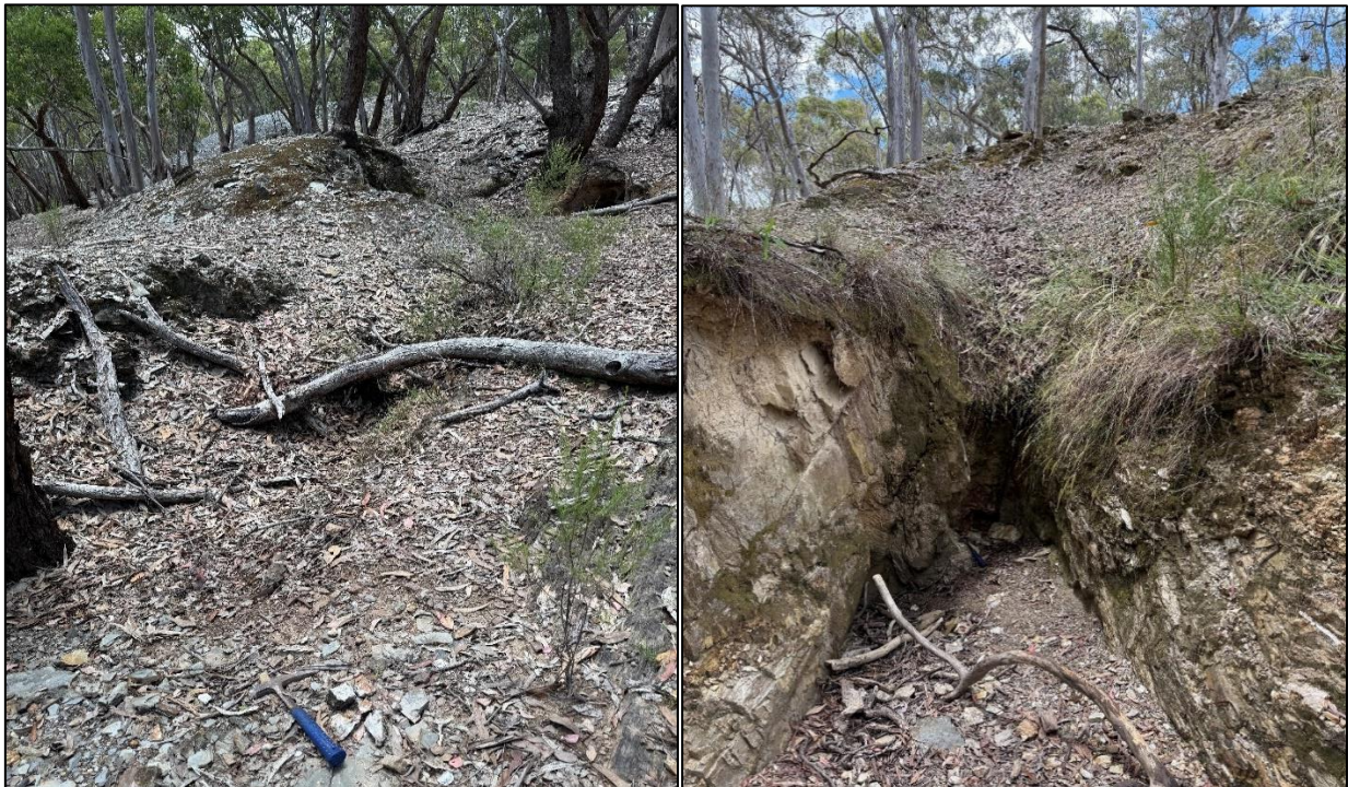
Figure 4 – Trunkey Creek Historical Shallow Gold Workings

The Trunkey Creek Project is located over the township of Trunkey Creek approximately 38km southwest of Bathurst and approximately 9km south-east of the Kempfield Project in NSW. The areas were first discovered in 1851 and worked from 1852 to 1880, and then again from 1887 to 1908. By 1873 there were 2,500 people at Trunkey Creek and nearby Tuena with many rich veins being mined for gold.