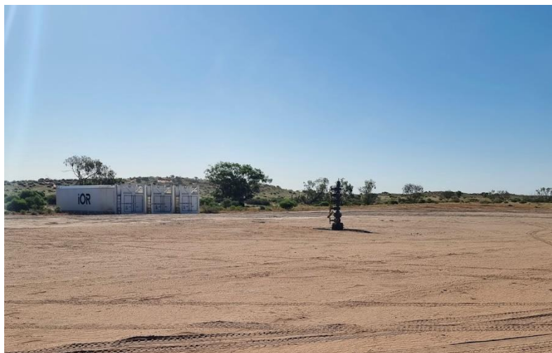
Figure 1: Kiwi 1 Wellsite post EPT

The Company has also made contact with suitably qualified engineering companies to submit proposals to carry out Front End Engineering Design (FEED) studies to finalise the scope and cost estimates for the field development. The aim of this work is to move the project forward to a FID as soon as possible.