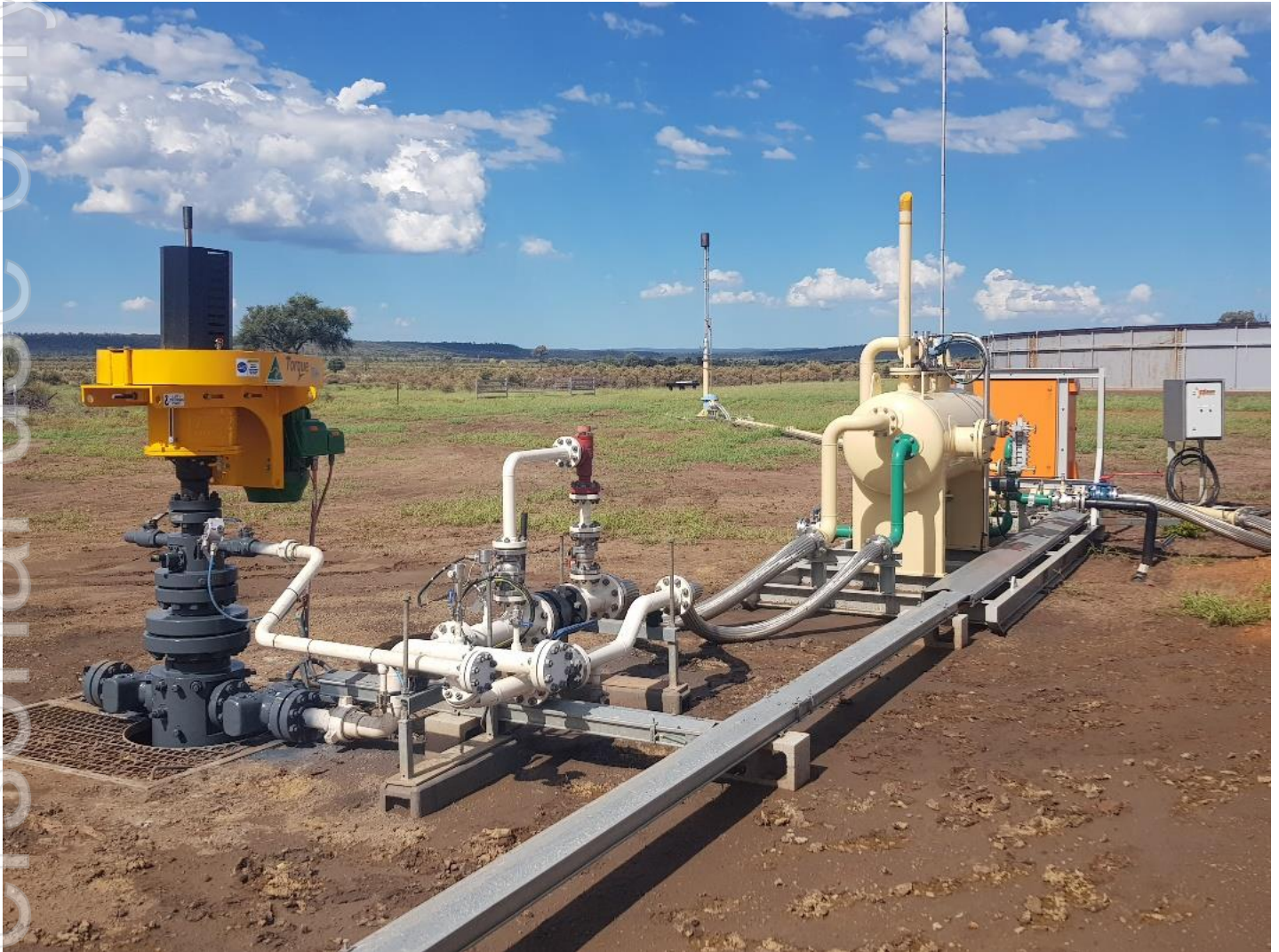
Figure 2: Mahalo East pilot flow package in place with wellhead and pump drive equipment on left, gas-water separator centre right and water storage tank and flare stack in the background.