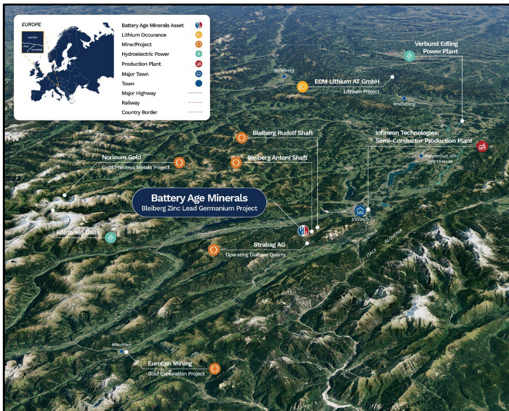
Figure 2: Bleiberg Zinc Lead Germanium Project located in the state of Carinthia, Austria.