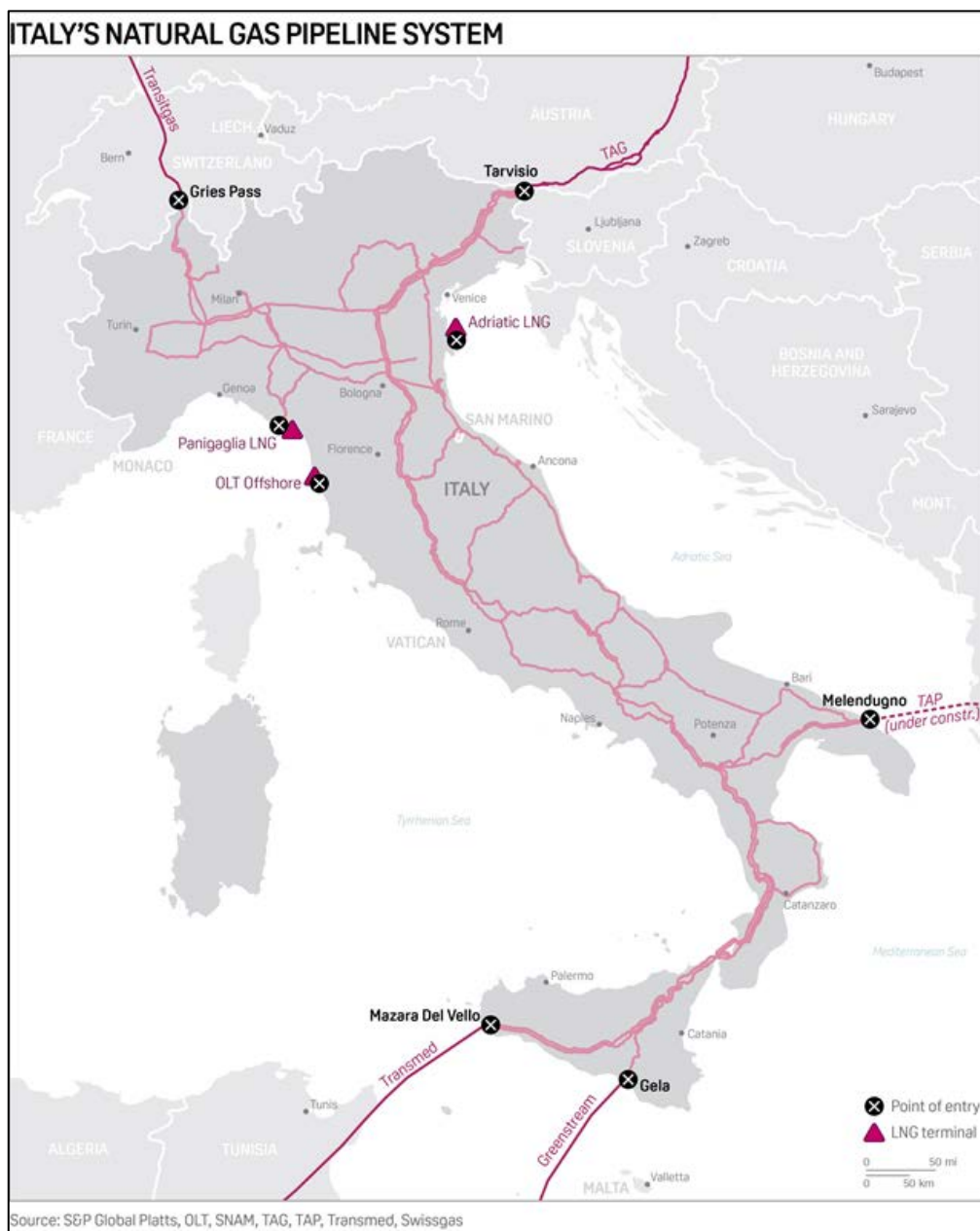
Figure 2: Location map showing Transmed and Greenstream pipeline systems proximal to the Permit.