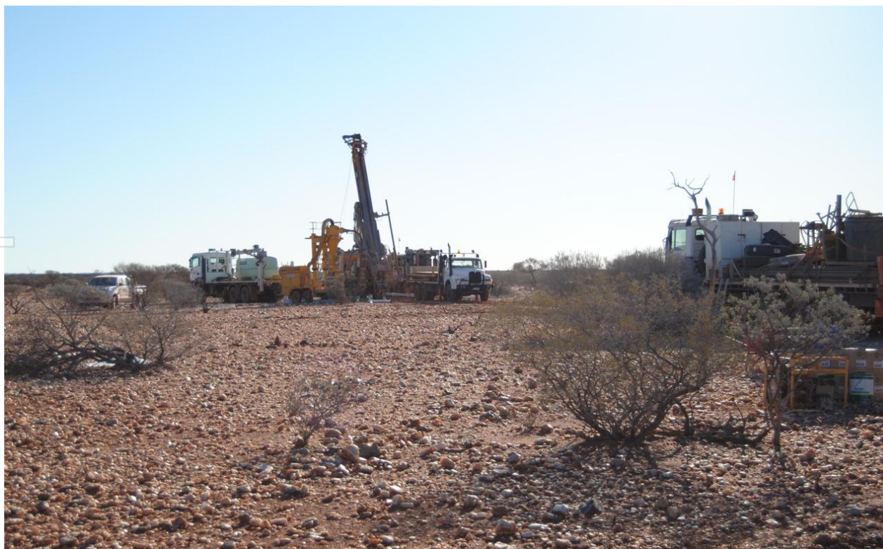
Fenix has a 28.97% stake in Athena Resources (ASX: AHN), owner of the Byro Magnetite Project in the Mid-West

On 2 December 2024, Athena announced that Fenix had elected to convert a portion of its convertible notes, such that Fenix became Athena's largest shareholder holding a 19.84% interest. Athena also announced a 1 for 2 renounceable rights issue, whereby Fenix would follow its rights as well as act as underwriter for the issue. Following completion of the rights issue in early January 2025, Fenix currently holds a 28.97% interest in Athena and is currently working with Athena to advance the exciting Byro Magnetite Project ( Byro ), located in the Mid-West 250km from the Port of Geraldton. Metallurgical test work and preliminary suitability testing carried out by Athena in 2024 identified the potential for an extremely high-grade concentrate with minimal impurities, suitable for supply to the emerging Green Steel market (see Athena Resources ASX announcement "Scoping Study" dated 20 May 2024).