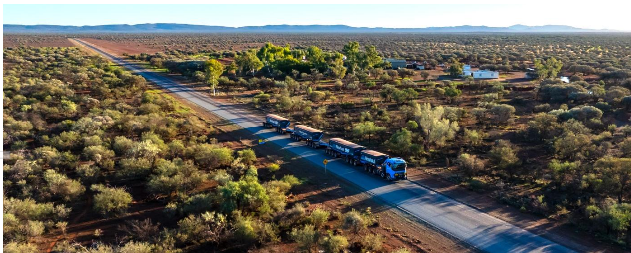
Fenix's Newhaul Road Logistics achieved the milestone of delivering its 6 million tonne on behalf of Fenix

During the December Quarter, Newhaul achieved the milestone of hauling 6Mt of Fenix iron ore. This resulted in the issue of 20 million shares in Fenix under the original acquisition agreement completed in 2022 (see ASX announcement dated 18 December 2024).