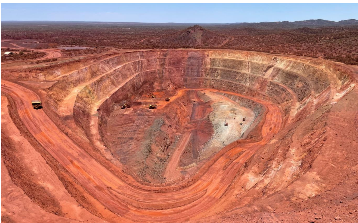
Fenix's Iron Ridge Iron Ore Mine – January 2025