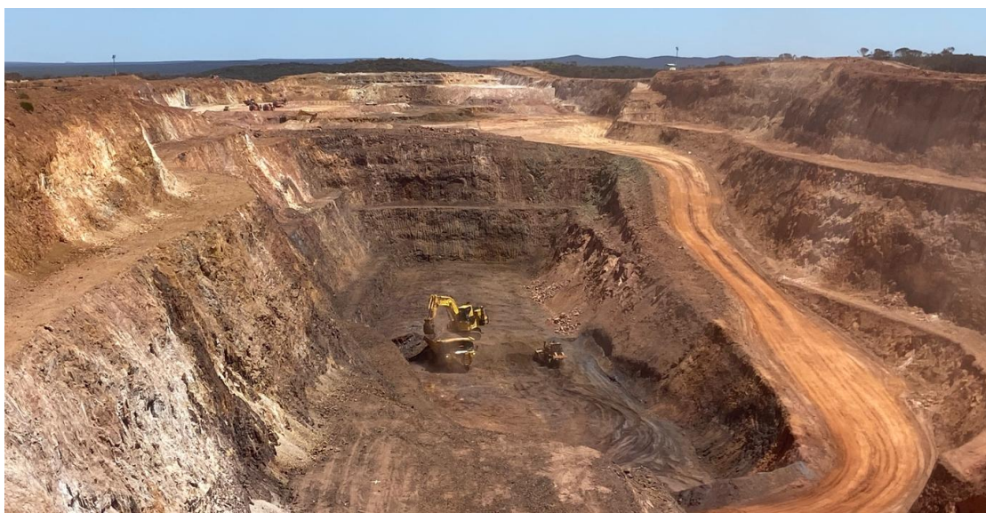
Fenix's 100% owned Shine Iron Ore Mine – January 2025

The Fenix team remains focused on developing its pipeline of growth projects whilst continuing the strong mining performance at Iron Ridge and Shine, commencing production from Beebyn-W11 and progressing further opportunities to grow the Group's operational footprint.