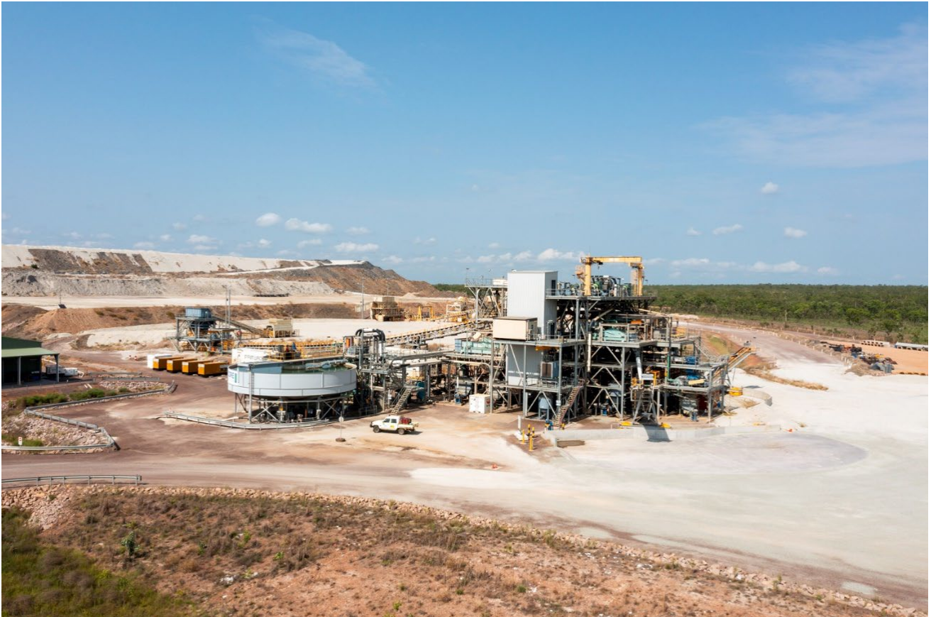
Figure 1 Grants processing site in October 2024

The ongoing work to date across mining and processing continues to align with our stated aim of delivering a more efficient, lower-cost operation at Finniss. These efforts seek to ensure the Finniss Project is well-positioned for a successful restart and aligned with evolving market conditions. Further updates on this work's progress will be shared as the Restart Study proceeds.