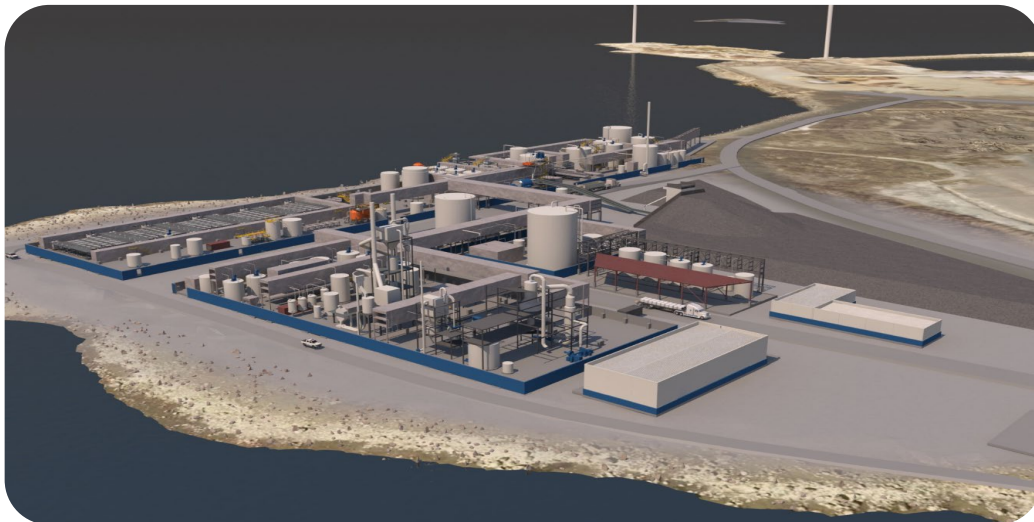
Figure 3 – Schematic View of the proposed VRP1 Plant at Tahkoluoto Port, Pori, Finland

During the quarter RISAB progressed a project financing process for equity and debt, with improved economics arising from an additional €15M conditional investment grant provided by the EU backed Finnish State NextGeneration fund and potential new 20% investment tax credit from the Finnish State.