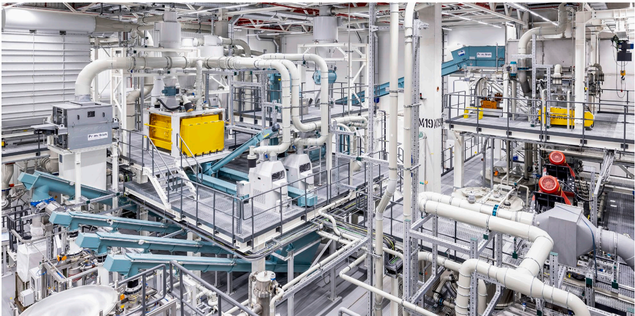
Figure 1 – Part of the Integrated LiB Plant installed by Primobius at Kuppenheim

In May 2022, Neometals announced that Primobius and Mercedes-Benz (“ Mercedes ”) had entered into a 5-year research collaboration aimed at jointly developing tailored, industrial-scale LiB recycling solutions for Mercedes-Benz. The industrial validation of Primobius patented recycling technology at Kuppenheim plant will precede the global offering of commercial scale ~20,000tpa integrated battery recycling plants.