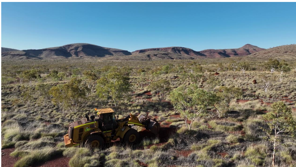
Figure 1: Rehabilitation work in the Delta Valley at Blacksmith

Over the past few months, Red Hawk has also completed an initial geotechnical assessment of the mine access haul road and topsoil characterisation within the Delta valley and proposed Badger camp location. Progressive rehabilitation of drill pads and access tracks within the Delta valley has been completed and reviewed by DEMIRS.