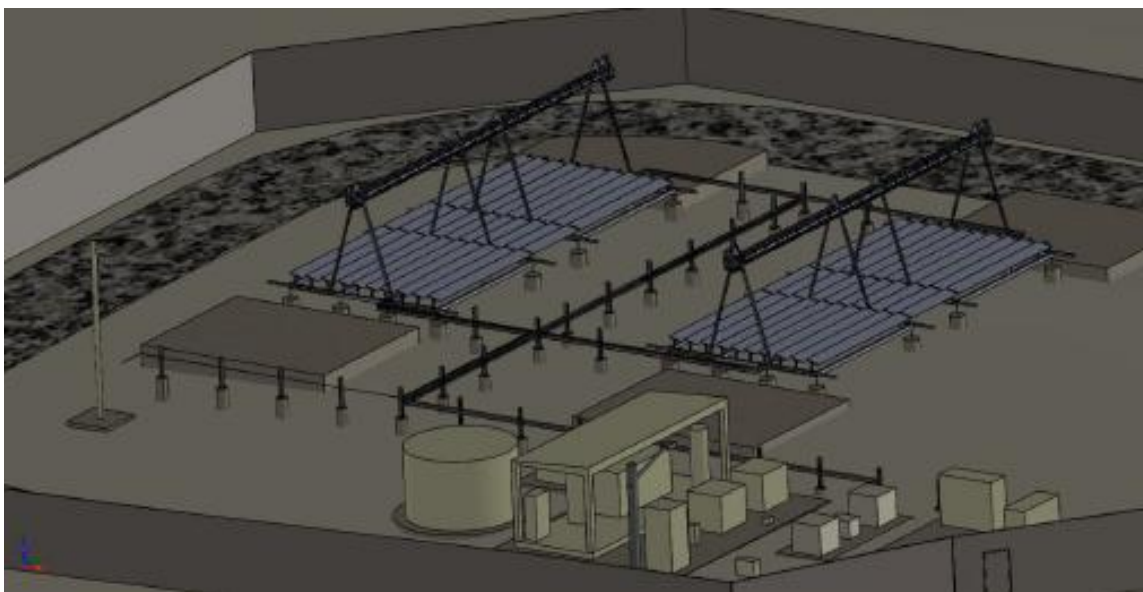
Figure 1: 3D pilot plant model based on FEED study