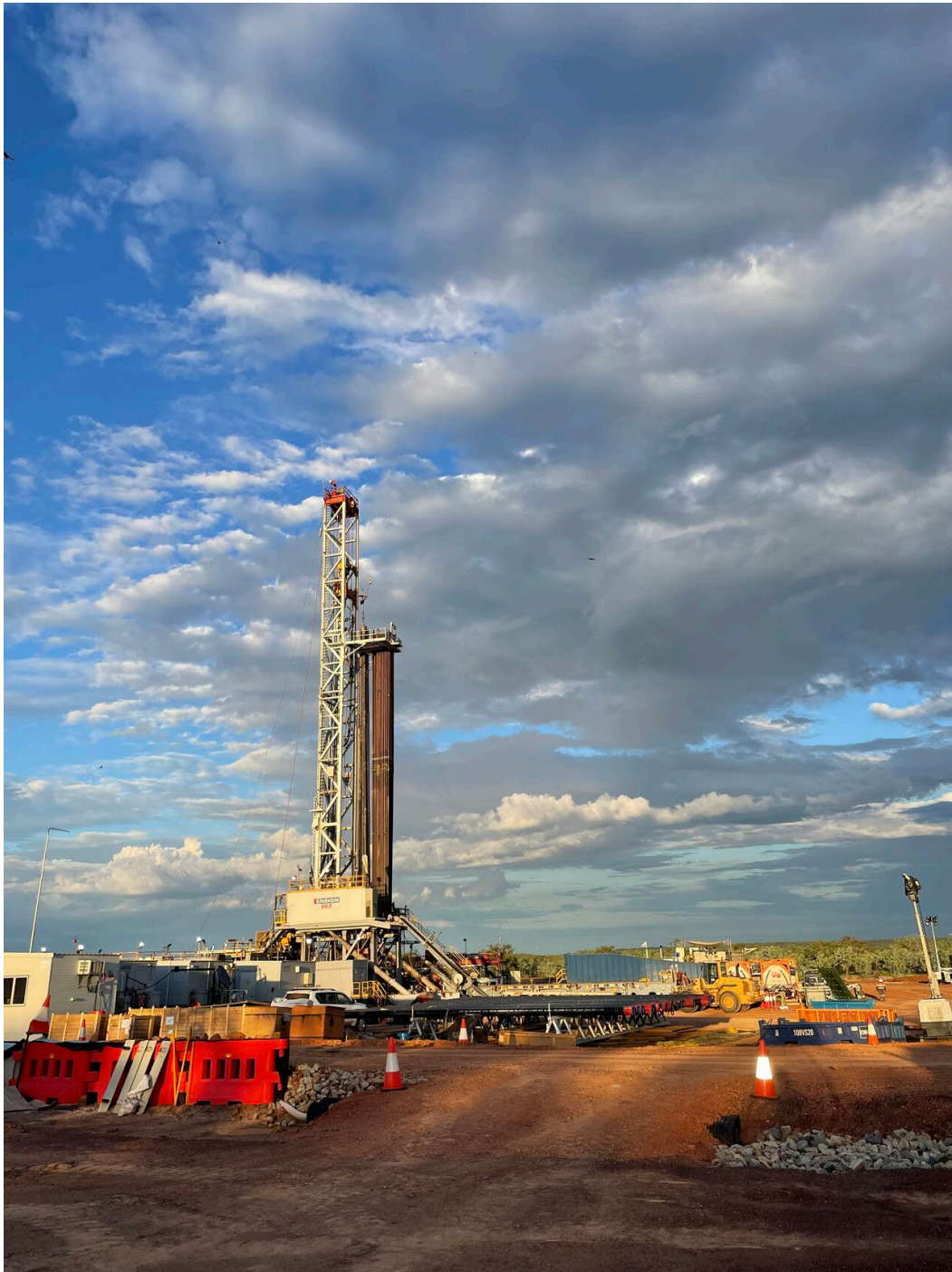
Carpentaria C5 Ensign drill rig on location in EP187

This ASX release has been authorised by the Board of Directors