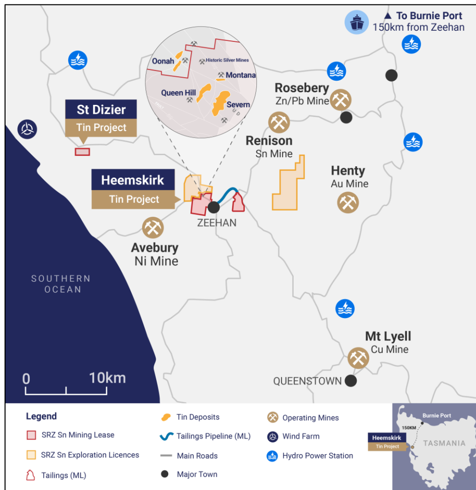
Stellar Resources Heemskirk Tin Project Location

Stellar also made a major discovery at its North Scamander Project in September 2023, with a maiden exploration drillhole intersecting a significant new high-grade silver, tin, zinc, lead and Indium polymetallic discovery. The Company has also delineated multiple down hole conductors via DHEM and FLEM surveys, providing high priority follow up targets.