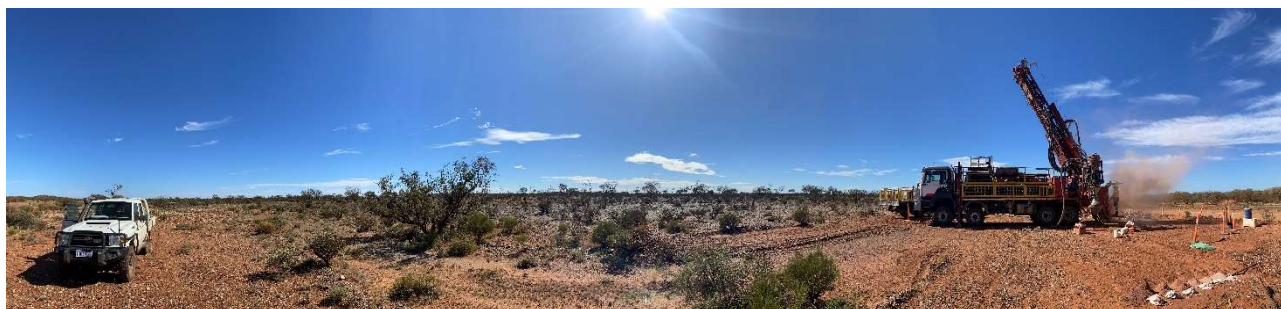
Figure 1 – Precision Exploration RC rig drilling at Golden Boulder, within the Duketon Gold Project.

"It is exciting to be back on the ground drilling at Golden Boulder, which is one of GSN's top-ranking prospects in the Duketon Project. This is based upon previous high-grade drill intercepts and a favourable structural setting where several gold-bearing structures coalesce. Golden Boulder hosts three mineralised trends and, prior to the Company's first campaign in 2021, it had seen minimal drilling since the 1990s. We are keen to execute a high-impact and cost-effective program and will eagerly await the assay results over the coming months."