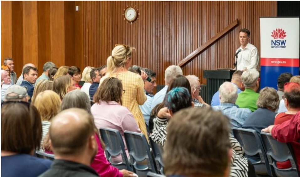
Figure 4: Community forum in Broken Hill attended by the NSW Premier and Cabinet Ministers

Hawsons continued to engage with the local community, landholders and indigenous organisations, maintaining an open dialogue on planned Project activities, potential impacts and opportunities.