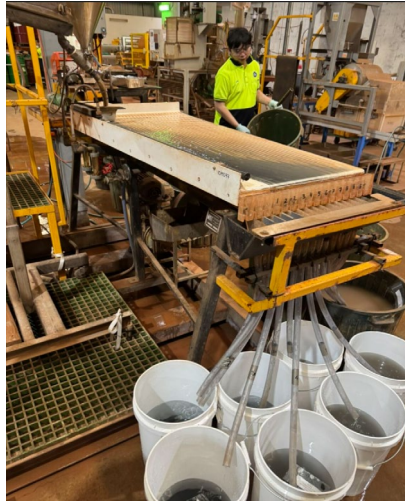
Figure 2: By-product testing at ALS - Perth

A study was commenced on the potential extraction of by-products from tailings stream. The study is evaluating the commercial viability production of high-grade Si-sands and non-magnetic iron and is anticipated to be completed around the end of Q2 2025.