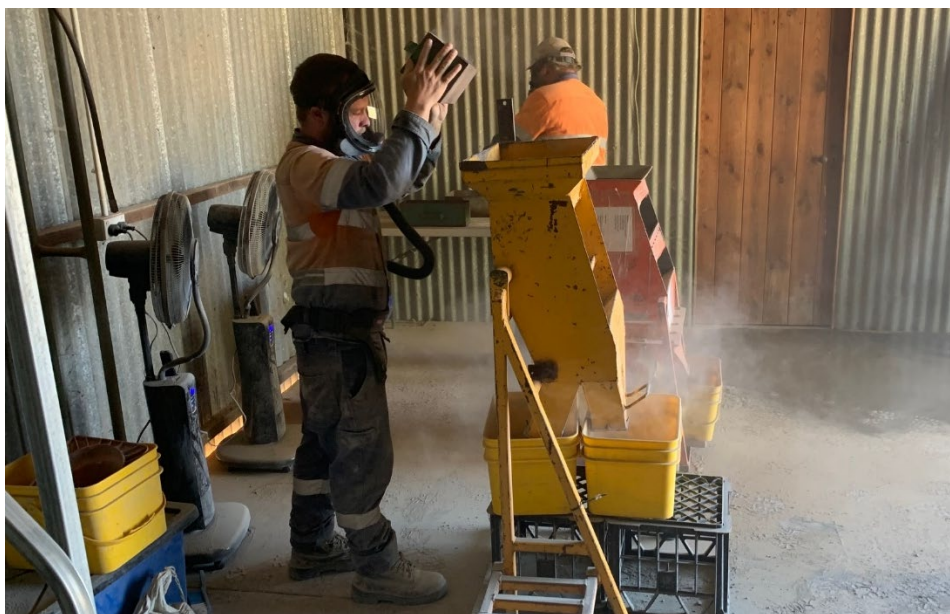
Figure 3: Sample preparation for variability & metallurgical test work

During the quarter, Hawsons undertook variability & metallurgical test works focused on the Fold Zone. This program will provide key data for future resource drilling, mine planning and the final process flow sheet. This work is anticipated to be completed around the end of Q1 2025.