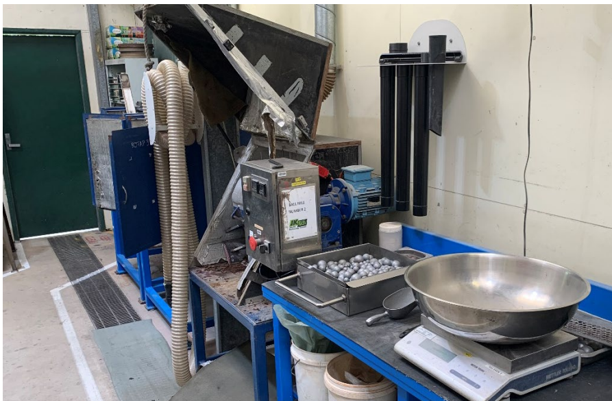
Figure 1: Comminution circuit testing

Hawsons will also investigate a 100% dry circuit as a priority given the scope for significant cost reduction as well as, environmental, scheduling and permitting benefits.