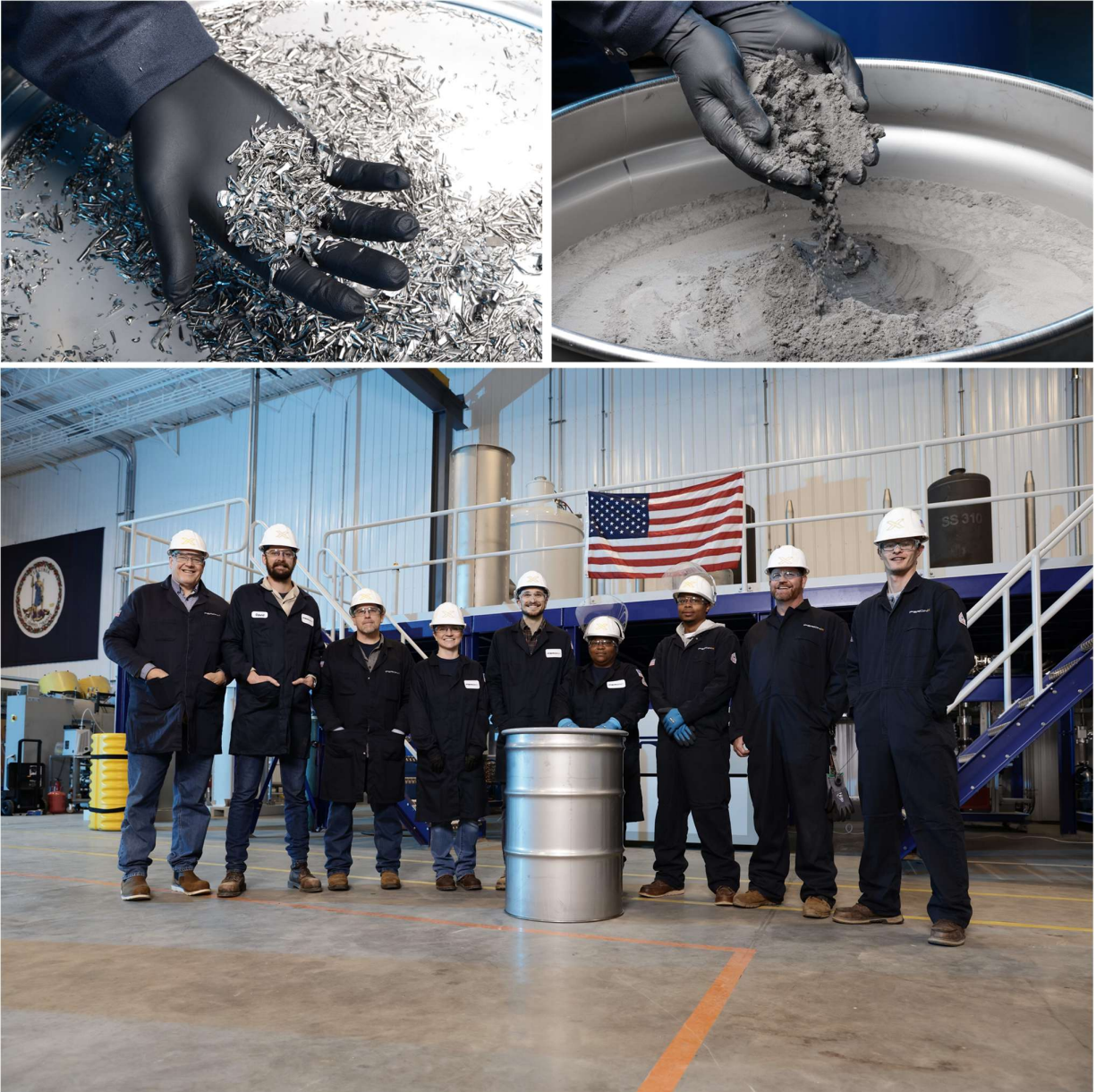
Figure 1 (clockwise from top left): Titanium scrap; Finished titanium metal powder; IperionX metal production team with a drum of finished titanium metal powder in front of the HAMR furnace at the Titanium Production Facility.

Progressive commissioning of the Virginia facility continued apace in preparation for routine titanium production cycles. Multiple process improvements were identified that are expected to increase titanium production capacity beyond nameplate levels by late 2025.