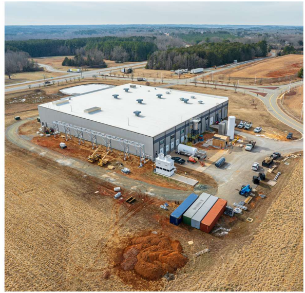
Figure 2: Development activity in July 2024 (LHS) compared to January 2025 (RHS), with external infrastructure installed, including argon storage tank & vaporizers, jet mill bag house and cooling water towers.