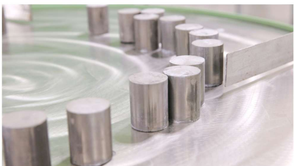
Figure 3 (clockwise from left): 100 ton uniaxial hydraulic press operations; Pre-HSPT fastener (LHS) and post- HSPT and threaded fastener (RHS); Pre-HSPT bars / pucks.

The HSPT technology allows IperionX to make high-quality titanium metal products directly from powder, without the need for high-energy and high-cost vacuum melting used in typical manufacturing processes. IperionX uses traditional powder metallurgy pressing equipment, including uniaxial pressing or cold isostatic pressing, to press metal powder into near net shapes, then directly sinters those shapes into titanium metal