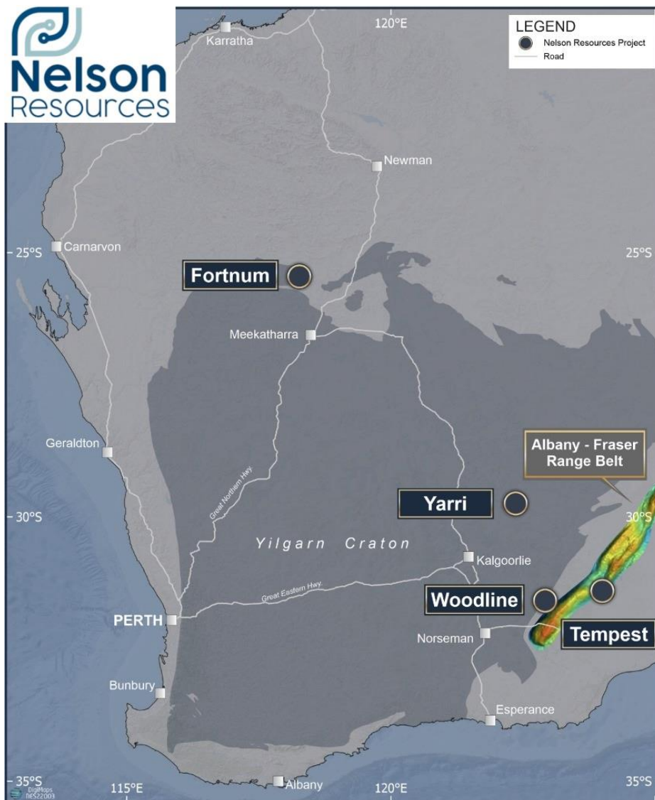
Figure 1: Project Locations.