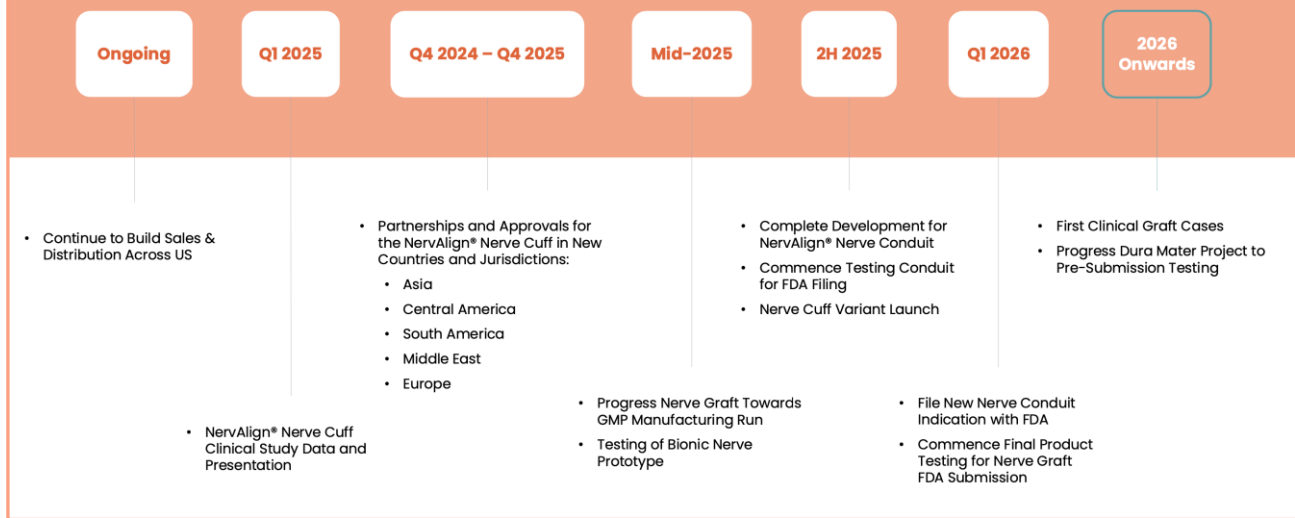
Figure 2 – ReNerve’s Anticipated Company Milestone Timeline