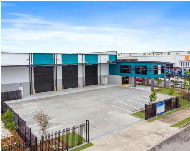
Figure 1: Site of CMG's vanadium electrolyte facility in the City of Logan

On 18 December 2024, the Company announced that a site in the City of Logan in South East Queensland had been secured for its Vanadium Electrolyte Manufacturing Facility. CMG has entered into a long-term lease for this site, which is pictured below. 2