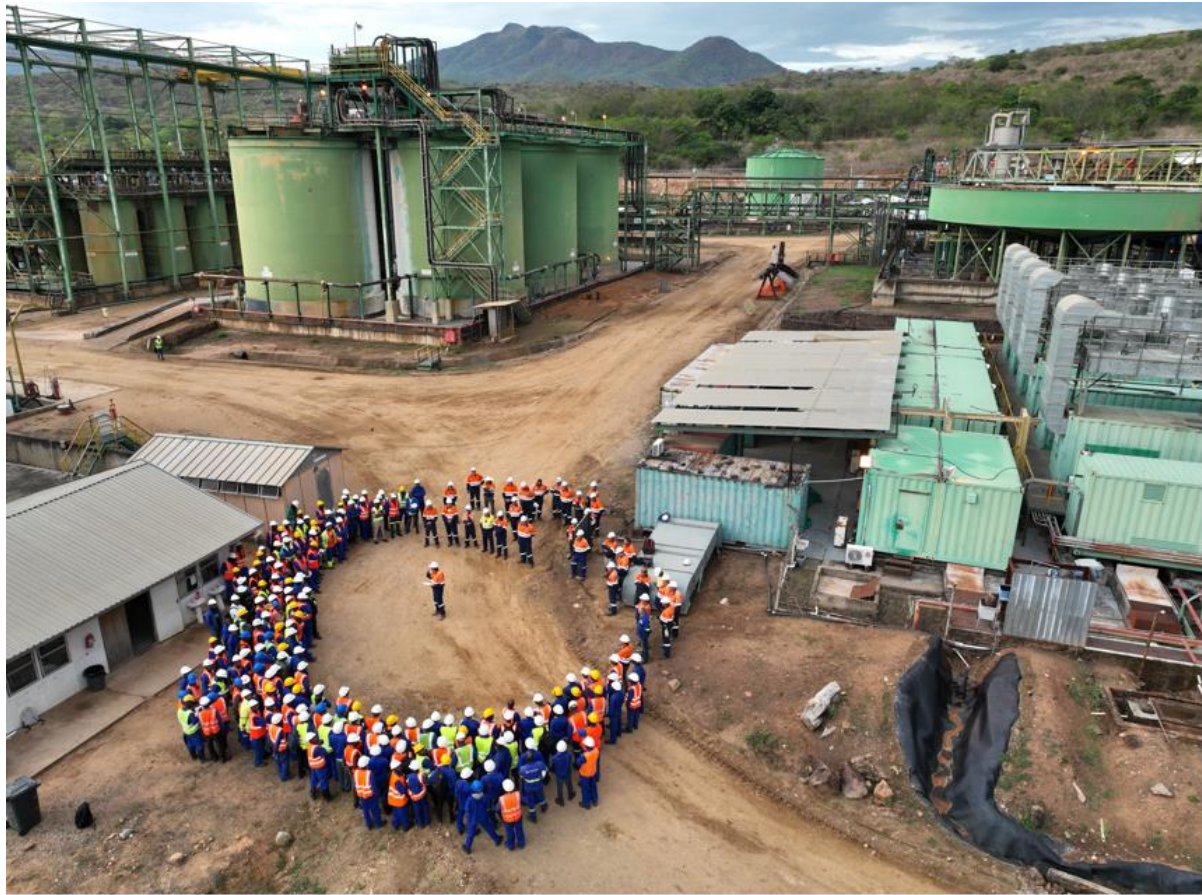
Figure 5: Team meeting of construction and refurbishment crew