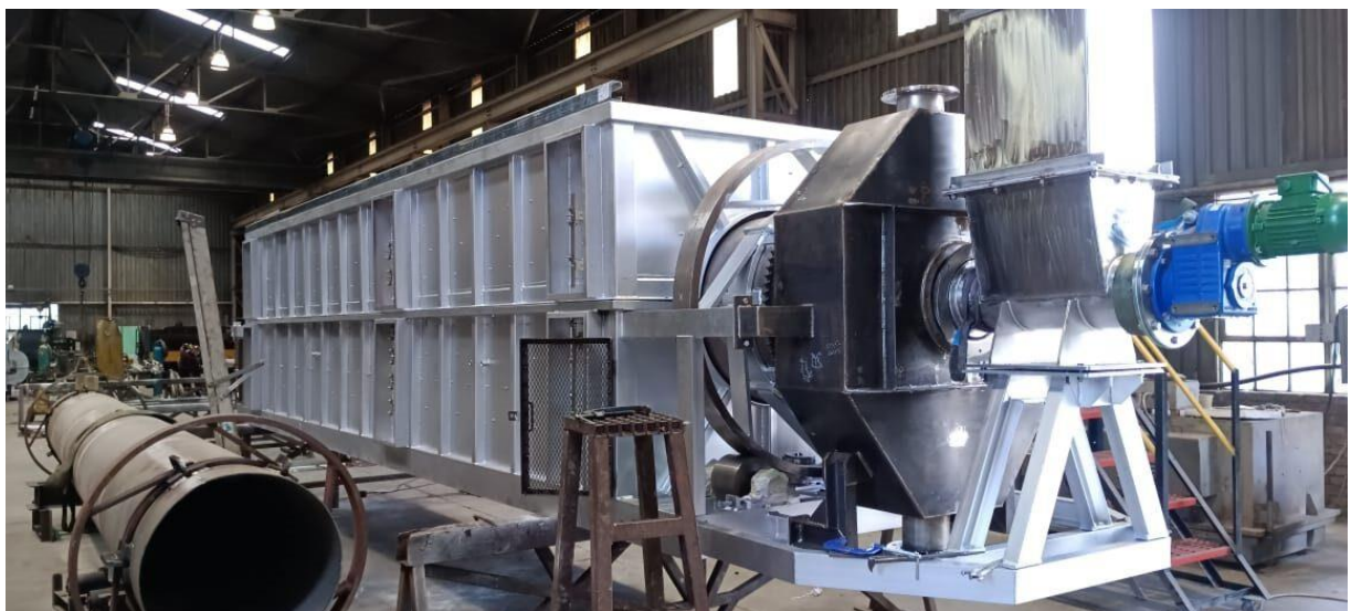
Figure 4: Calciner at Kayelekera is mechanically complete

Key operations management personnel have been recruited, along with a 200+ construction crew members of both local and expat personnel to ensure the restart is completed on schedule and the Company is ready for operations.