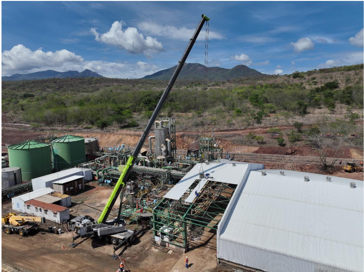
Figure 3: 200t crane on site at Kayelekera – the largest crane in Malawi