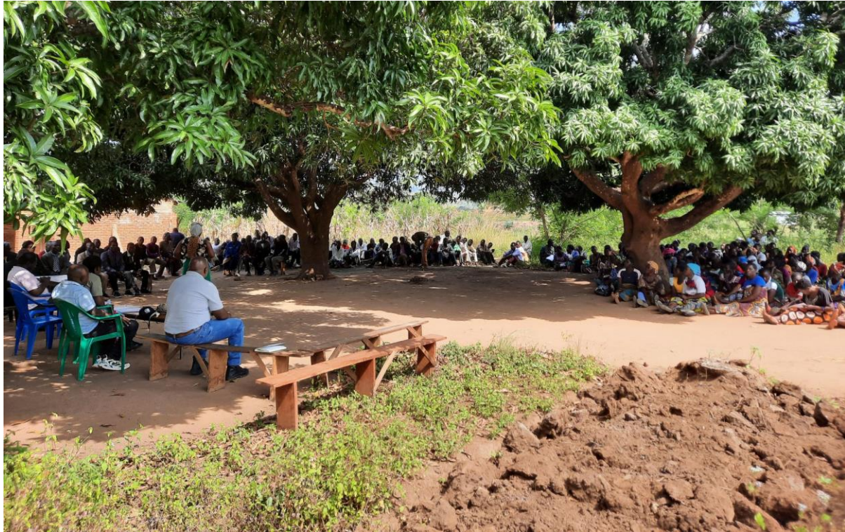
Figure 7: Stakeholder engagement meeting undertaken for the transmission line from the Town of Karonga to the Kayelekera mine