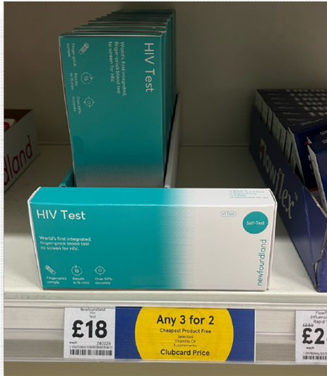
Newfoundland Brand Atomo Test on a UK retail shelf

The company has supported various state level implementation partners tasked with scaling national vending machine access to free tests, with a material step up in ordering through this channel anticipated in the coming quarter as installed machines now become operational.