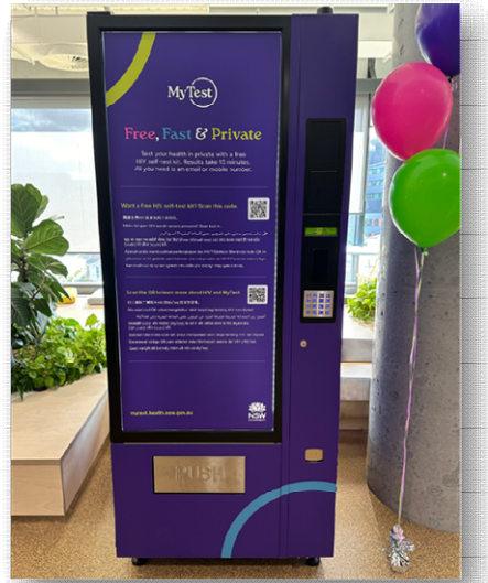
NSW Health HIV Vending Machine

Post quarter end, Atomo announced the renegotiation of its relationship with its European partner Newfoundland Diagnostics, rebalancing the agreement into a long-term commitment. Under the agreement which runs until 30 June 2030 and is worth A$5.44m, Atomo is building a long-term channel in the rapidly emerging pharmacy/retail rapid test market.