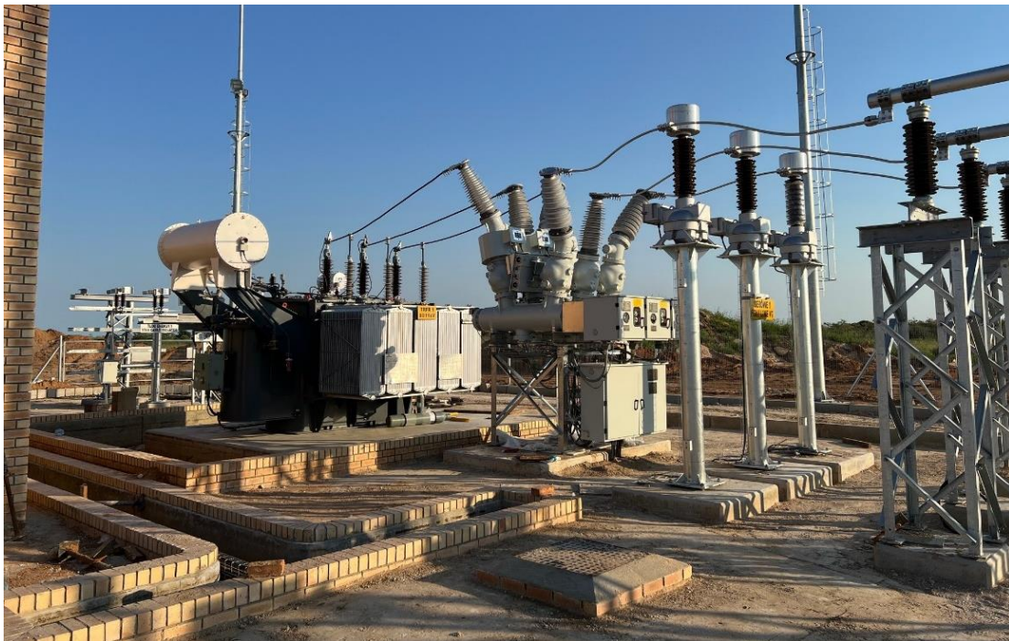
Lesedi Substation – January 2025

The December 2024 quarter marked significant progress for Tlou Energy with its flagship Lesedi Gas-to-Power Project ("Lesedi") advancing towards first power sales in 2025. Key milestones include the near completion of the Lesedi substation and continued optimisation of gas production. With Lesedi positioned as Botswana's leading gas project, Tlou is ideally placed to address the region's growing demand for reliable baseload power.