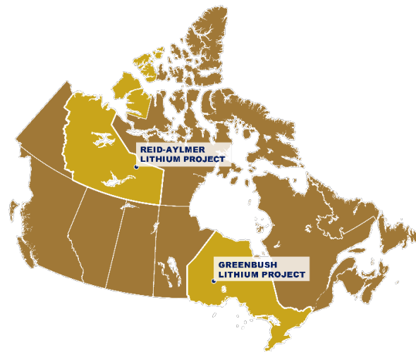
Midas Minerals Canadian Projects Location Map

Reid-Aylmer Project: The Company has 100% of staked mineral claims totalling 157km 2 located northeast of Yellowknife, in the Northwest Territories of Canada. Initial limited exploration has resulted in the discovery of the large Argus pegmatite which contains abundant spodumene. Assay results from rock chip sampling returned up to 7.25% Li 2 O (refer ASX release dated 12 December 2023).