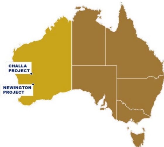
Midas Minerals Western Australia Projects Location Map