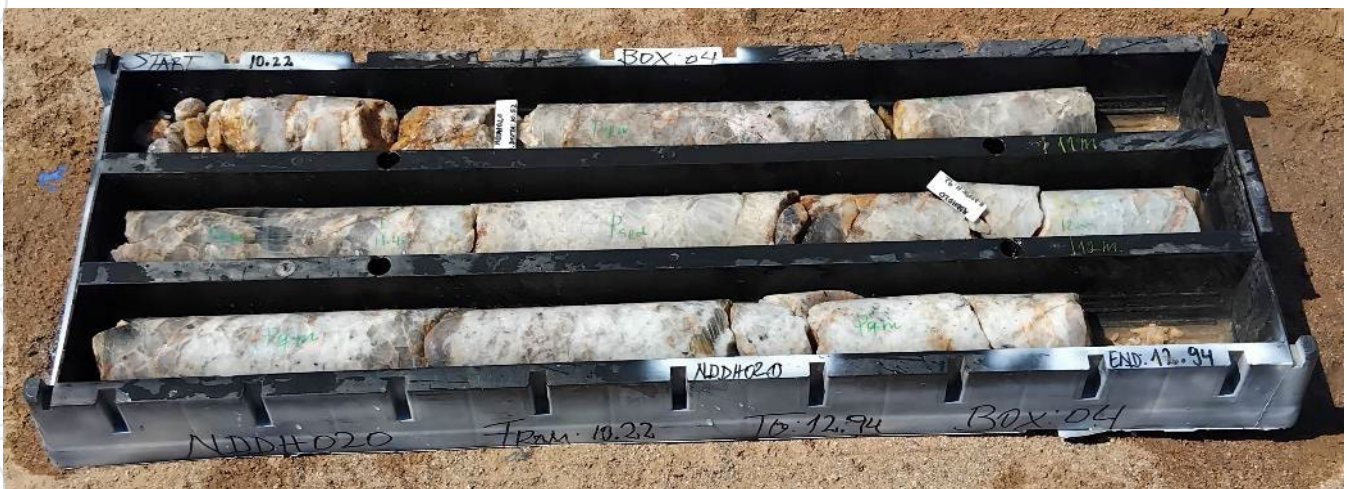
Photograph 1: Core from hole NDDH020 from 10.22 to 12.94m drilled at the Loop Prospect. Project geologists logged this interval as having up to 20% spodumene 3 .