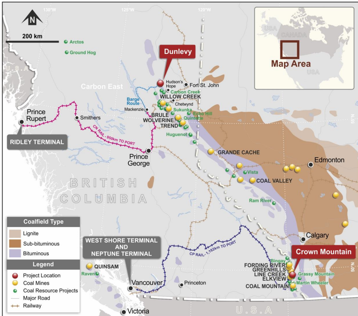
Figure 1 – Project Location Plan