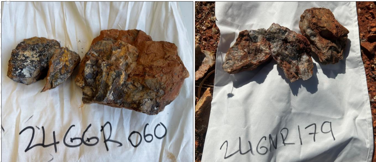
Figure 2: Crescent East sample 24GGR060 (left) and Mulloo Hill sample 24GNR179 (right)

The program also identified a new greenfield target at Mulloo Hill, located approximately 15 km south of Crescent, which returned high-grade gold results and represents a previously untested mineralised trend (Figure 2).