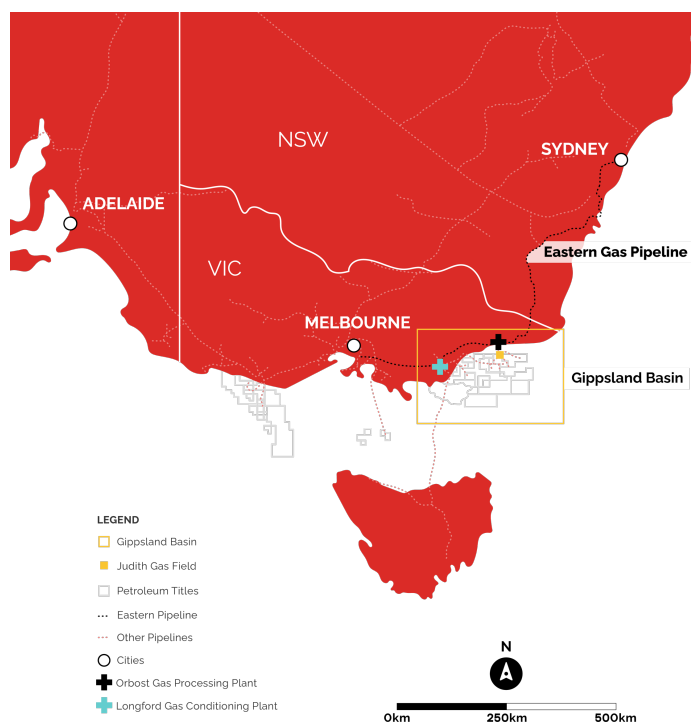
Figure 2: Judith Gas Field, Gippsland Basin