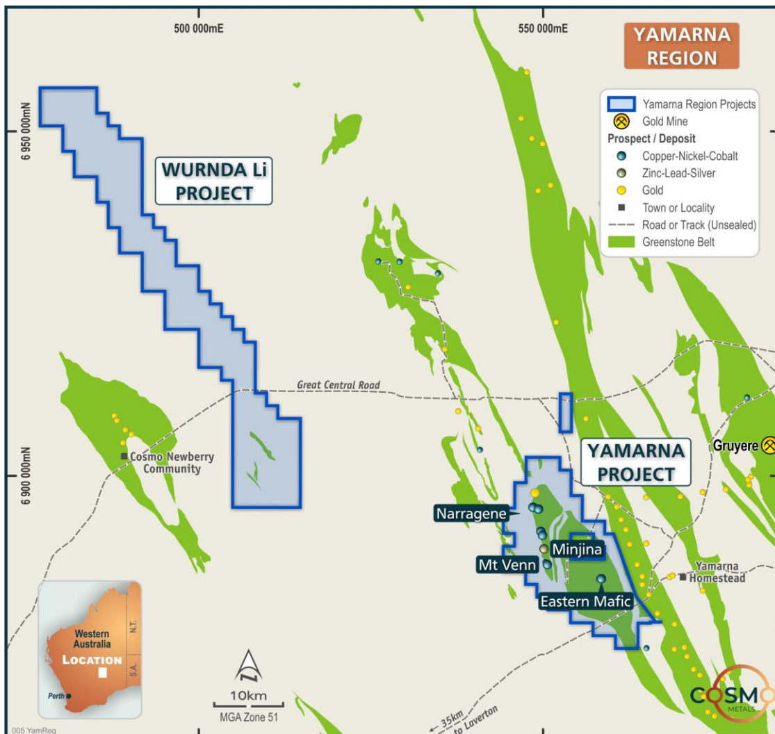
Figure 2: Cosmo Metals’ Yamarna Region Projects, Eastern Goldfields Western Australia.

The Yamarna Project, approximately 130km east of Laverton in Western Australia, includes the Mt Venn deposit (Cu-Ni-Co), the Minjina discovery (Zn-Pb-Cu-Ag) and the Eastern Mafic prospect (Cu-Ni-PGE). The contiguous Narragene tenement (E38/3640), covering a further 8km strike length of the Mt Venn greenstone, is prospective for both Mt Venn–style (Cu-Ni-Co) mineralisation as well as VMS (Zn-Pb-Cu-Ag) mineralisation associated with felsic volcanics ( refer Figure 2 ).