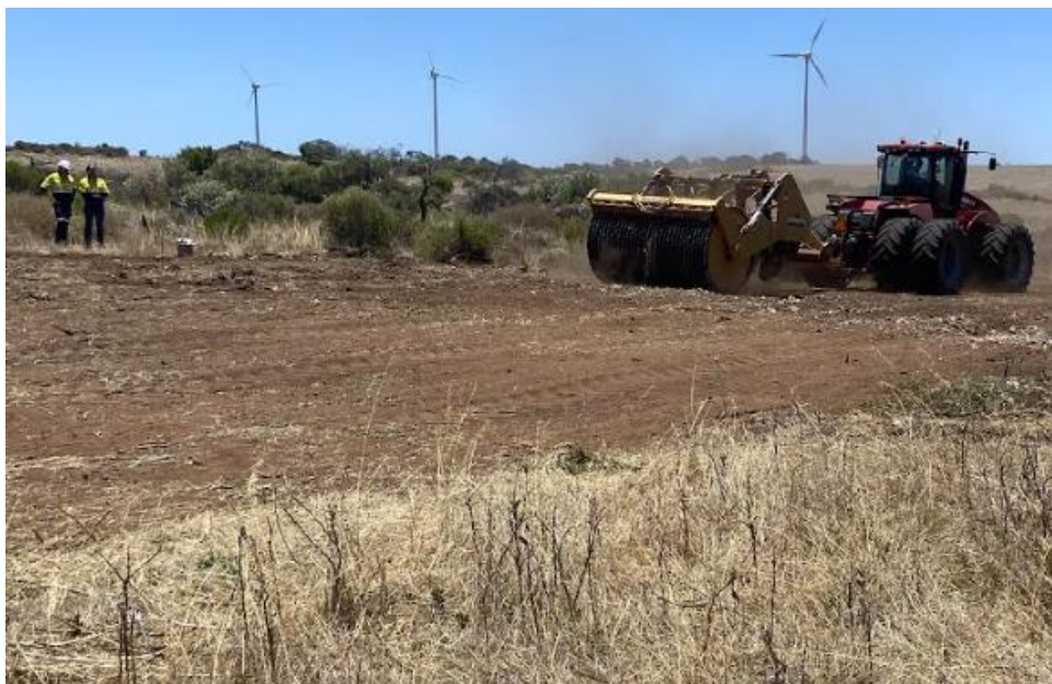
Figure 3 – The Rocksgone Dynamic Force Crusher (DFC) operating at the future Port Gregory mine site