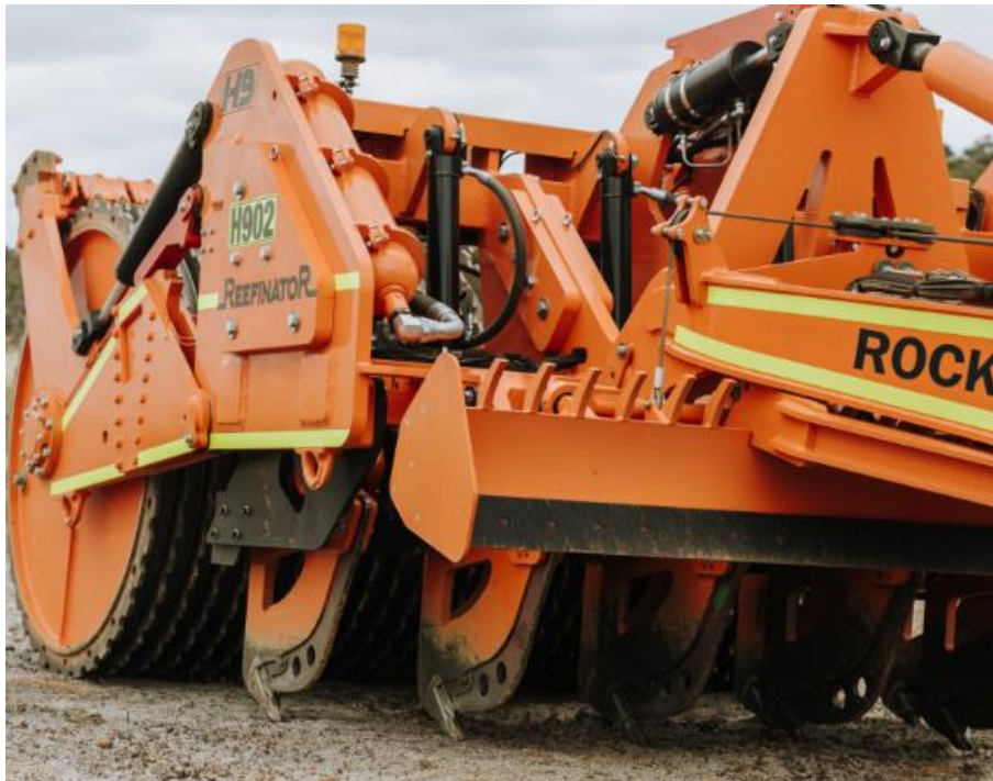
Figure 2 – The Rocksgone Dynamic Force Crusher (DFC) or Reefinator

HVY undertook mining equipment trials onsite during the quarter. In particular, a Dynamic Force Crusher (DFC) was mobilised and utilised to expose and crush at surface and near surface limestone. The DFC was supplied and operated by Rocksgone a Western Australian based OEM. A Caterpillar D9 dozer was also mobilised and tested with the limestone rock. AMC and IHC Mining consultants were present for the trials which were very successful, and the information gathered will be used to inform the mining aspects of the PFS.