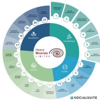
Figure 2: World Economic Forum Governance Metrics

Heavy Minerals Limited (HVY) remains steadfast in its dedication to ESG principles and sustainability, recognising them as essential drivers for long-term value. The Company has worked with Socialsuite and has selected the United Nations’ Sustainable Development Goals (SDGs) as appropriate standards to align with. In 2023 work commenced to complete a baseline assessment against the Stakeholder Capitalism Metrics (SCM) framework established by the World Economic Forum (WEF). The baseline assessment is well advanced, and the Company is progressing towards establishing an ESG disclosure report against the 21 WEF metrics in due course. The baseline assessment is complete and will be further advances as the study phases progress.