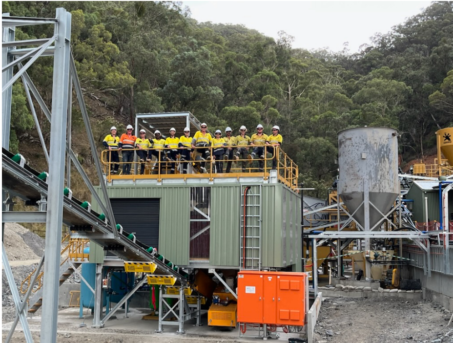
Figure 4 Gekko Installation and commissioning team on top of the Ore Sorter