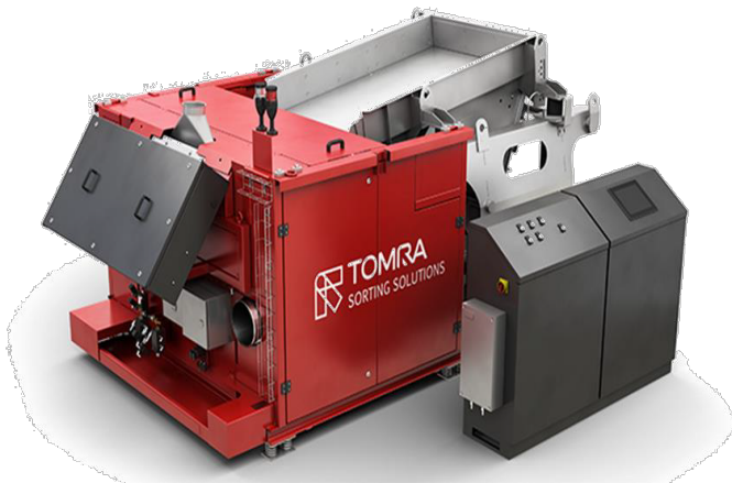
Figure 6 Picture of the Tomra laser sorter

This announcement has been approved by the Vertex Board of Directors