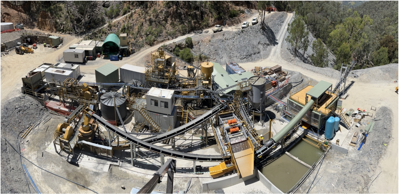
Figure 5 Birds eye view of the Hill End Gravity Gold plant with sorter (left side)