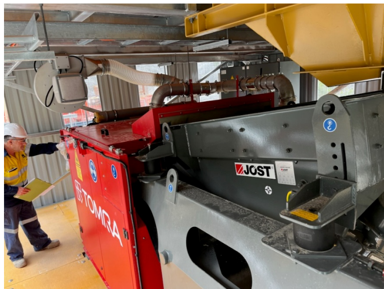
Figure 2 Gekko technician testing the mechanical components of the Ore sorter