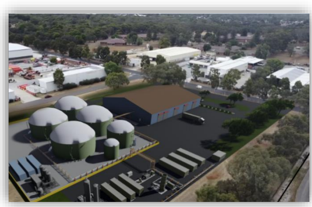
Image 7: SA1 Bioenergy Plant Render Image 8-9: SA1 Bioenergy Project Site

In December 2024, the Delorean Board reached Financial Investment Decision to proceed with the construction of Delorean's SA1 bioenergy project in Edinburgh Parks, South Australia. Procurement of all long lead items has progressed, and site works have begun.