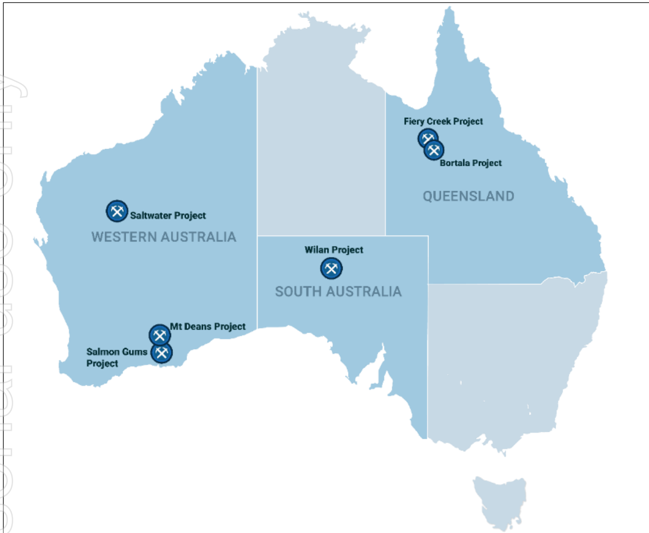
Figure 3 - Aruma Resources project portfolio including Wilan IOCG-Uranium Project, South Australia and Fiery Creek and Bortala Copper Projects, Queensland.