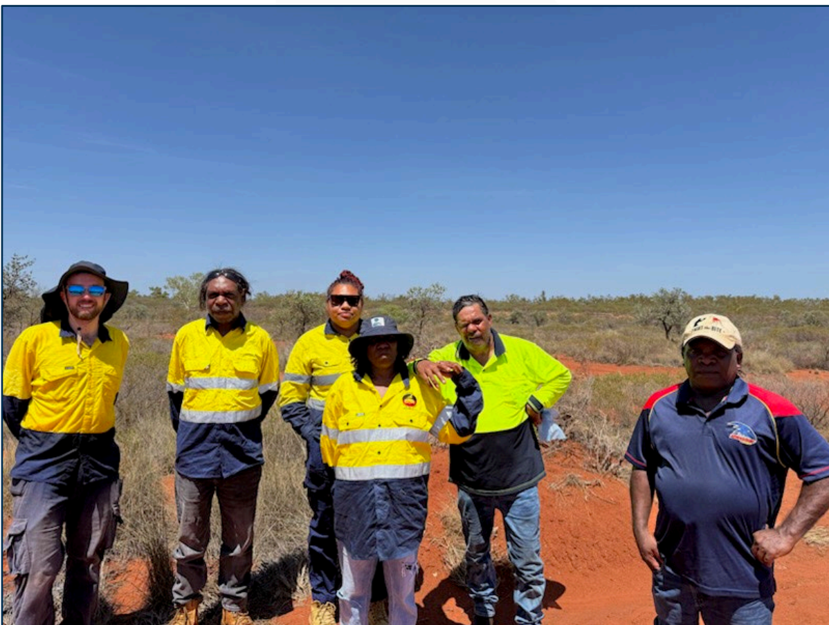
Figure 4. Survey participants of the Site Avoidance Survey conducted at the Wagyu Gold Project on 20 & 21 December 2024.