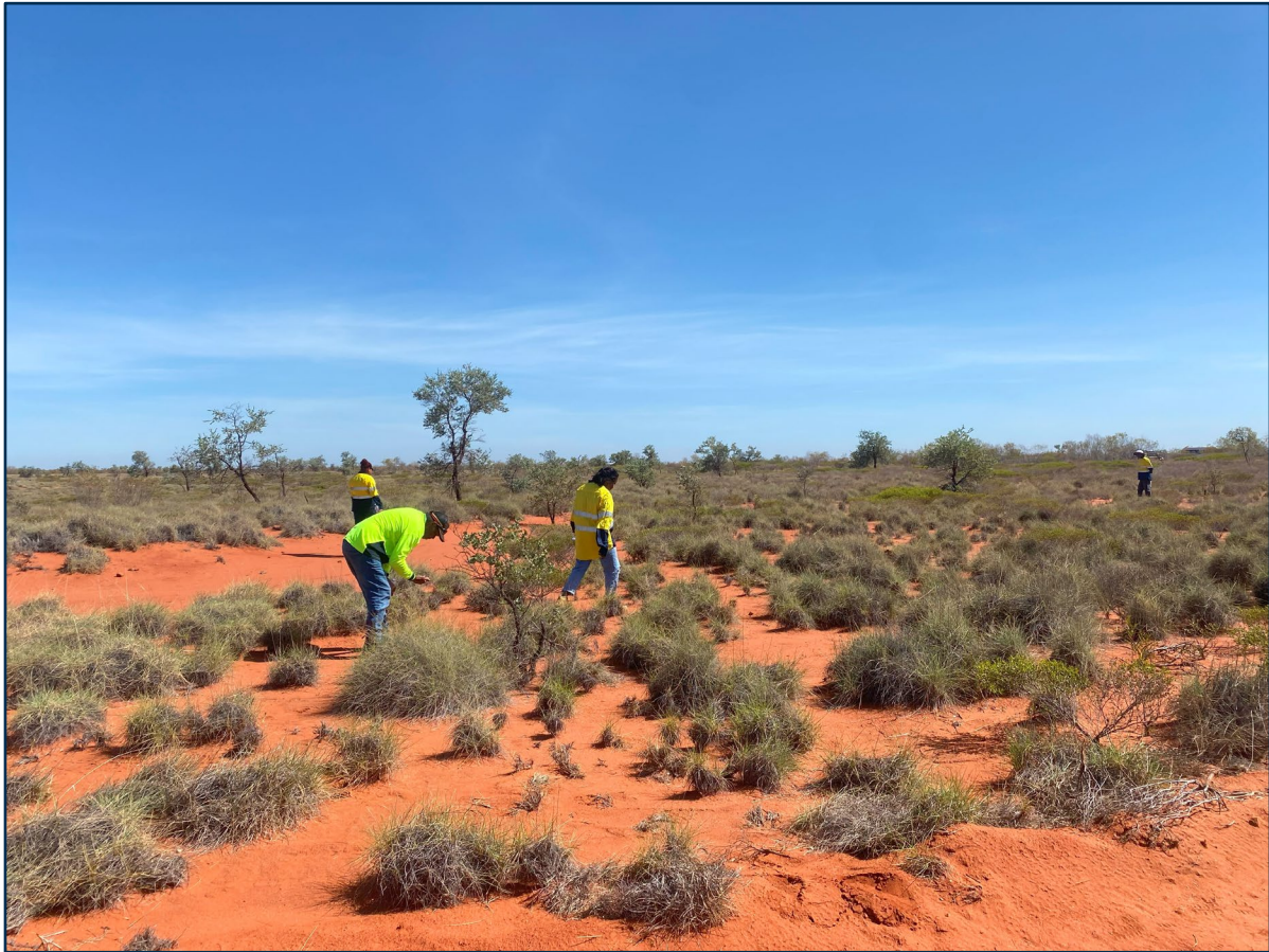
Figure 3: Participants conducting a transect during the site avoidance survey at the Wagyu Gold Project on 20 December 2024.