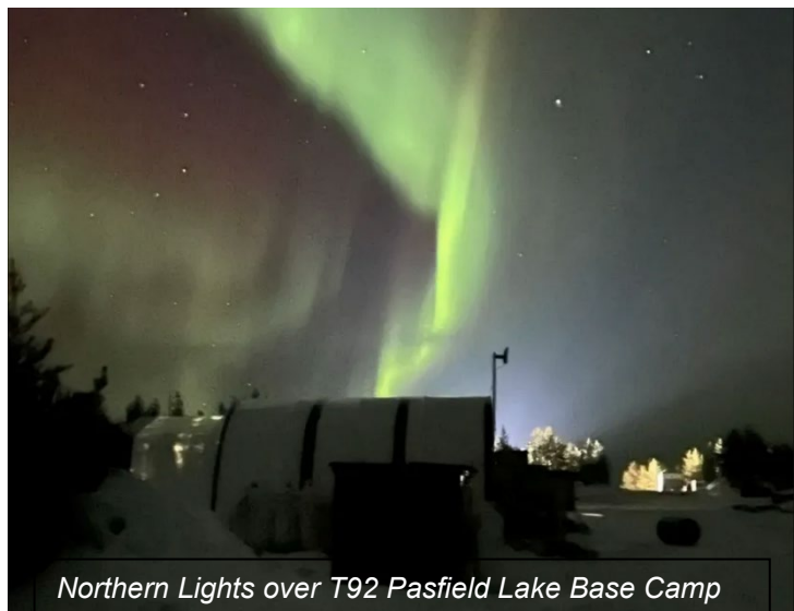
Northern Lights over T92 Pasfield Lake Base Camp